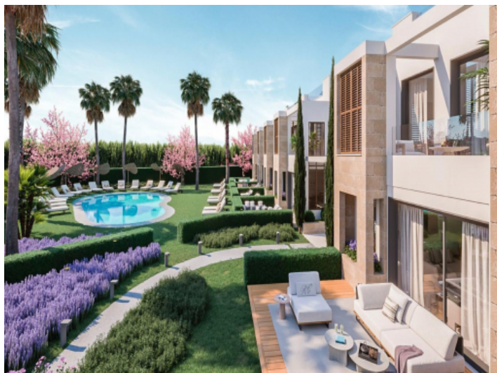
Private garden and community pool