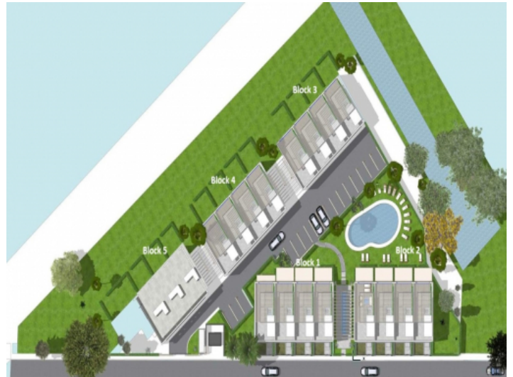
Plan of the community