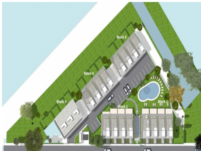
Plan of the community