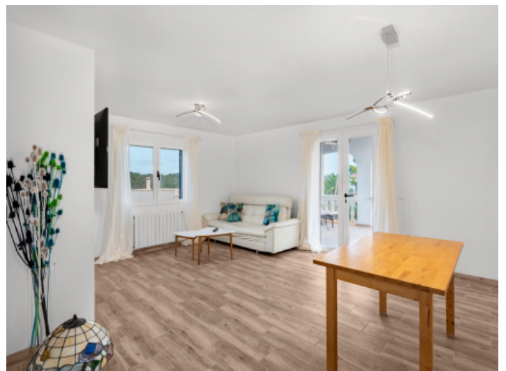
Living and dining area 1. floor