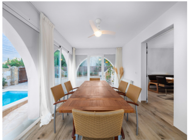
Dining area conservatory