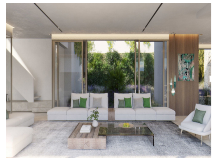
Spacious living area