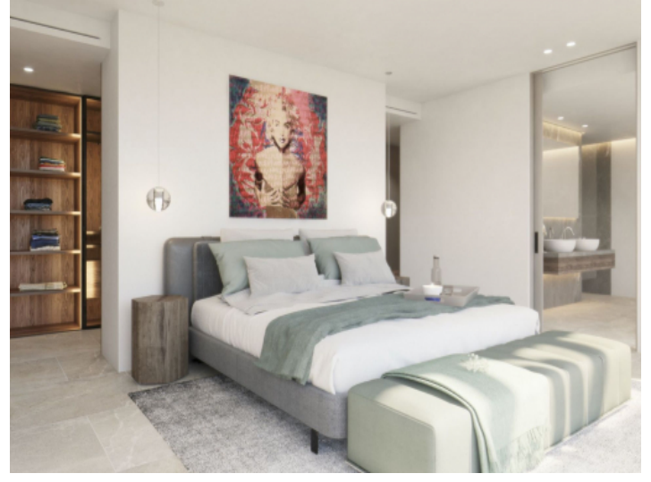
One of 7 bedrooms