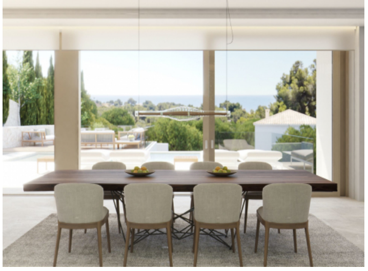
Light-flooded dining area