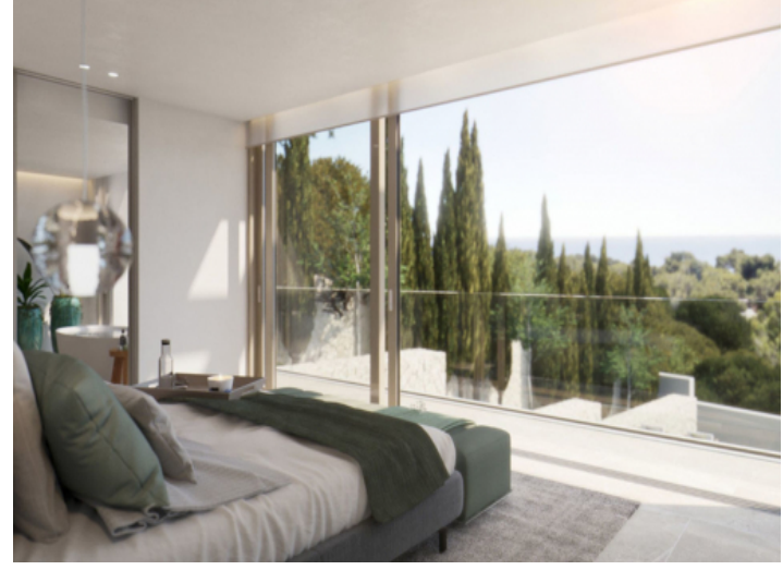
One of 7 bedrooms

PORTA MALLORQUINA • C./ COLOM 20 2°, 07001 PALMA, SPAIN TEL.: +34 971 698 242 • INFO@PORTAMALLORQUINA.COM • WWW.PORTAMALLORQUINA.COM