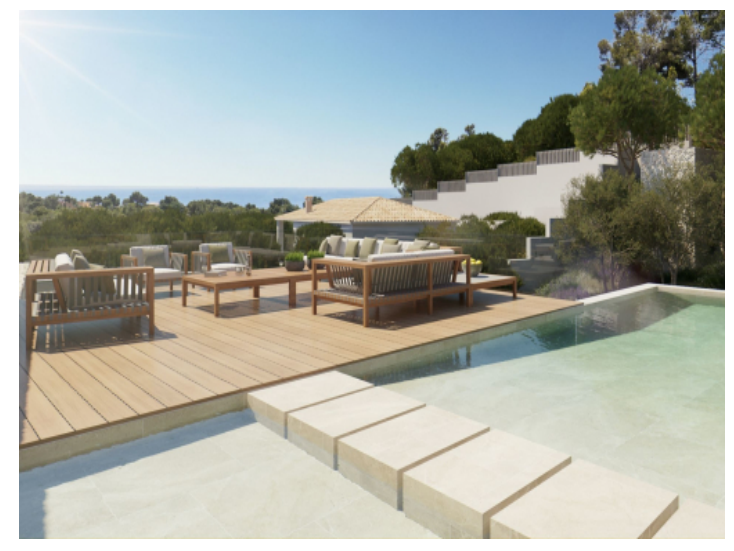
Fantastic pool area with sea views