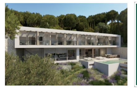
Portals Nous search for property MAL-121978