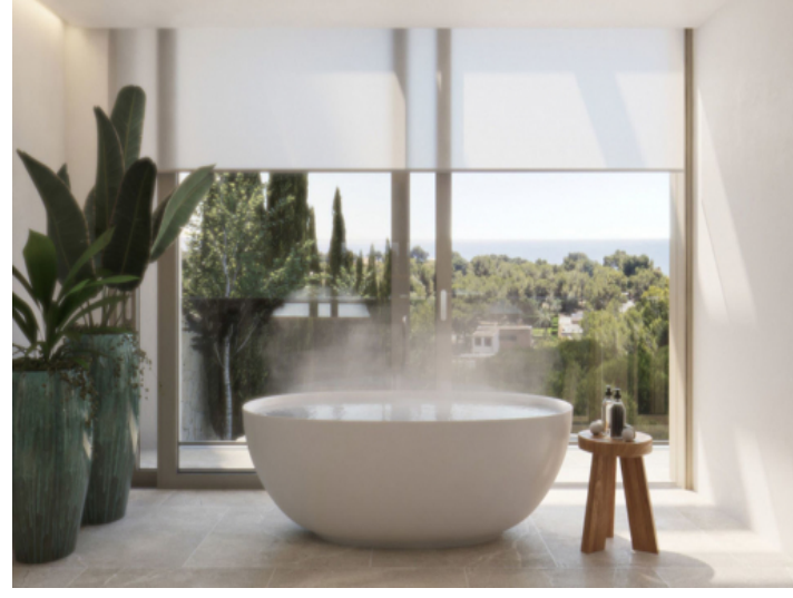
One of 7 bathrooms