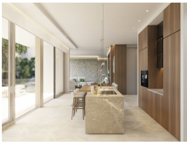
Modern kitchen with island