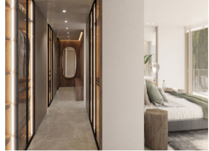
Superb dressing area