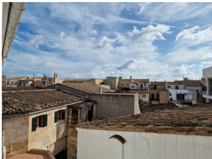
Views over the village