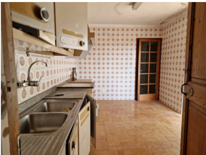
Kitchen with vintage tiles