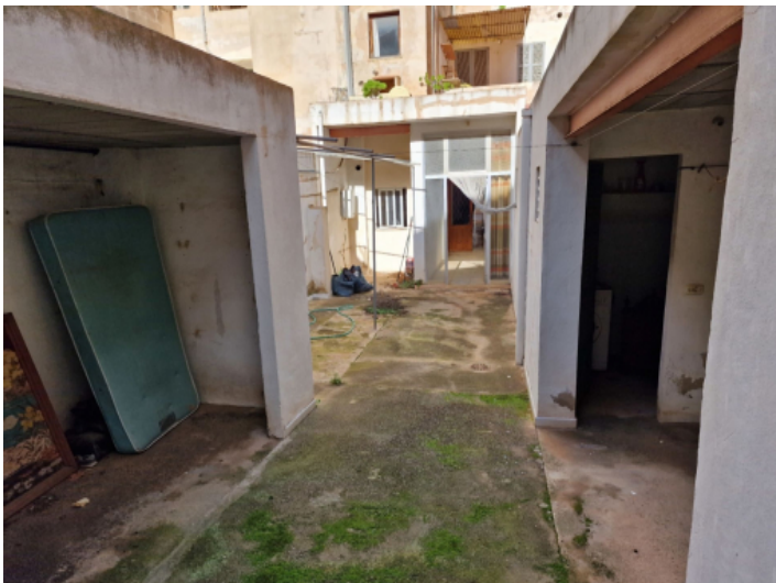
Patio view to the façade