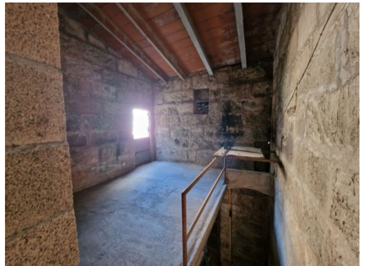
Expandable space above the garage