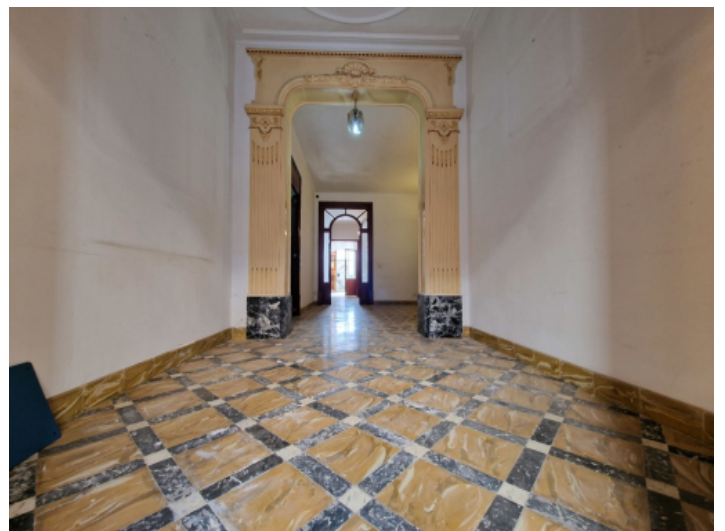
Entrance area with original tiles