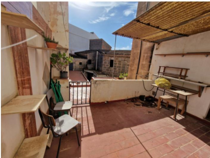
Sunny terrace on the first floor