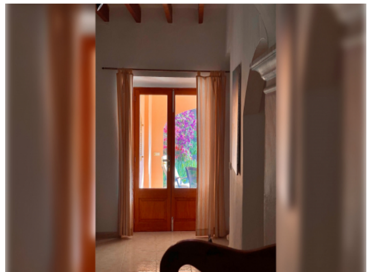
Access to the garden