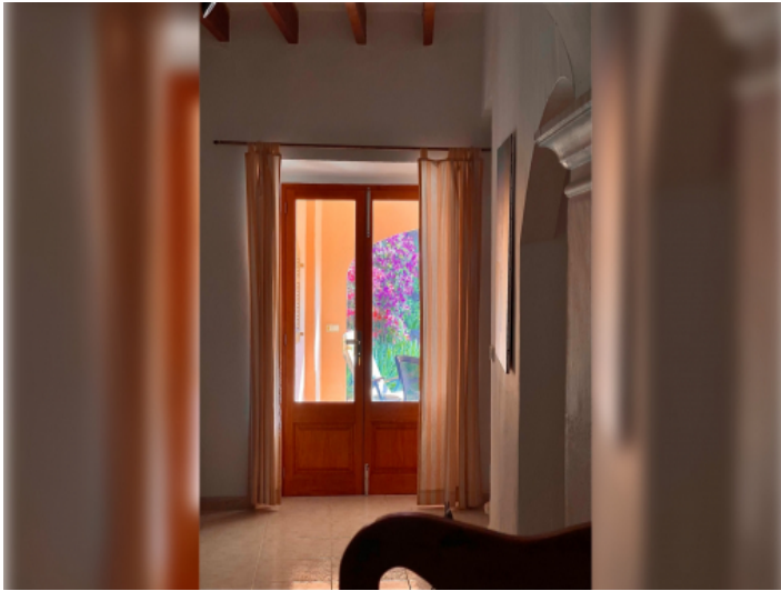
Access to the garden