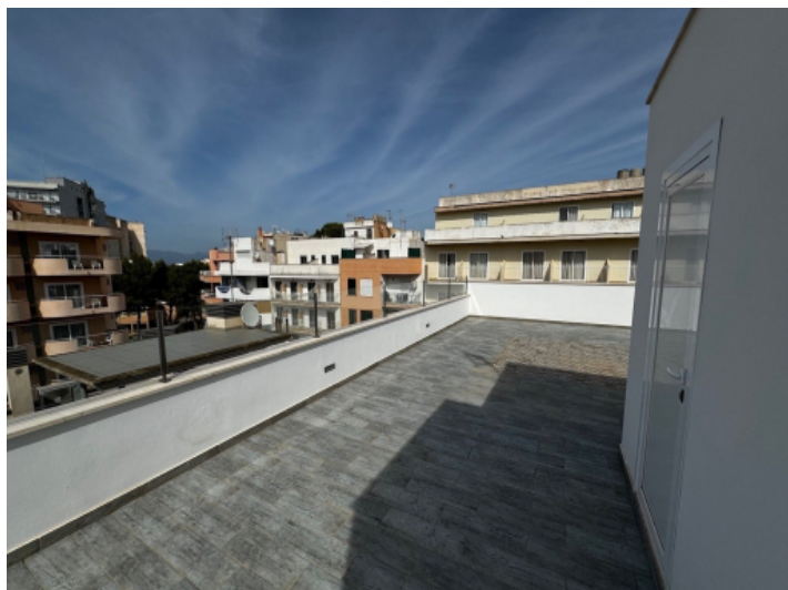
Additional view of the roof terrace