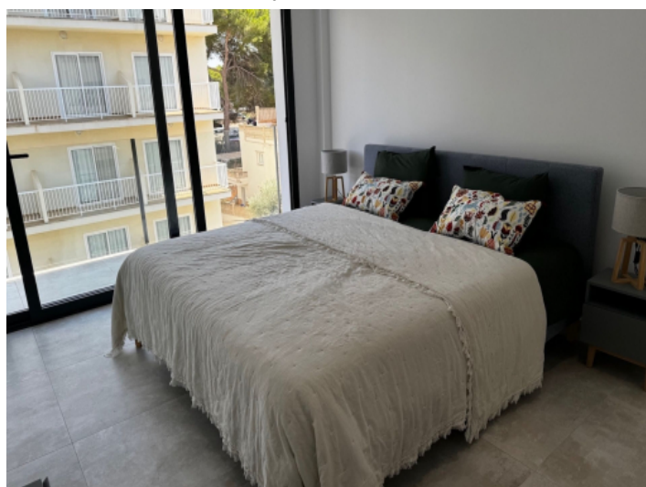
Spacious double bedroom