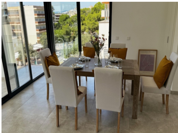
Lovely dining area