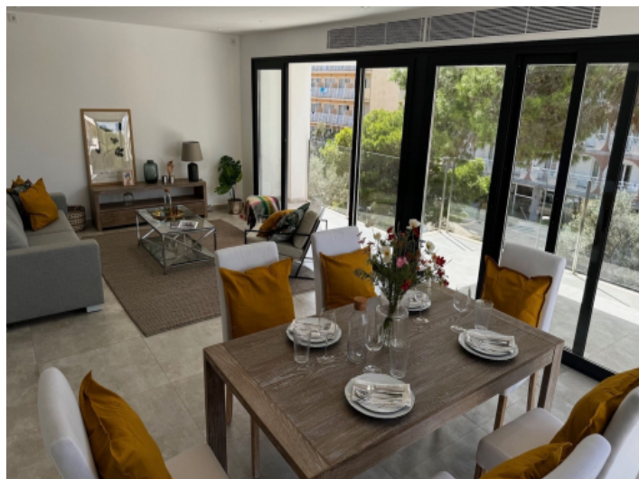
Light-flooded living and dining area