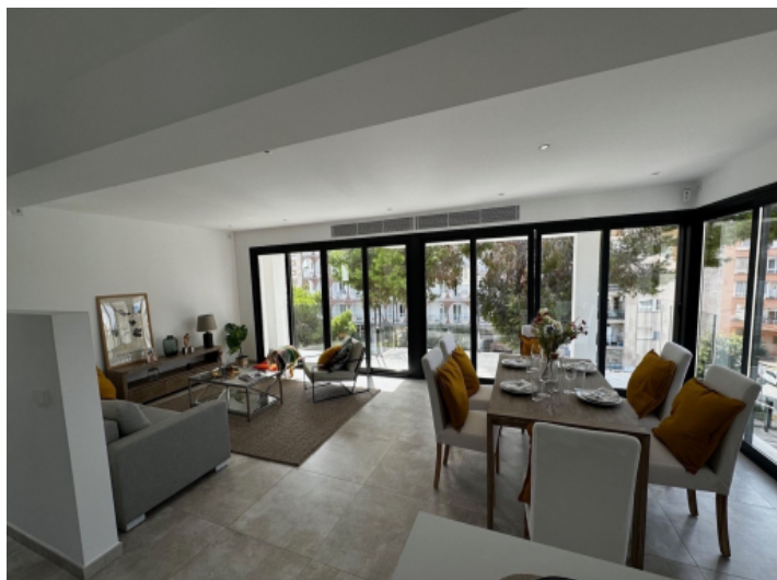
Open plan living area