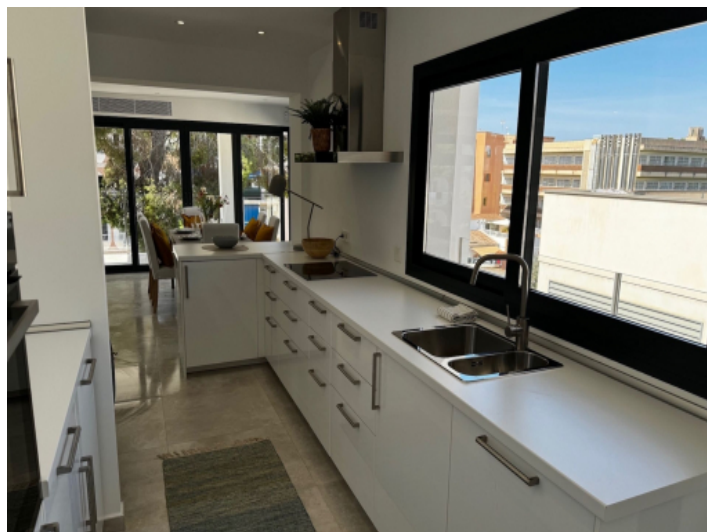
Fully fitted kitchen