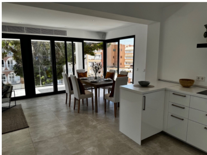
Modern kitchen and dining area