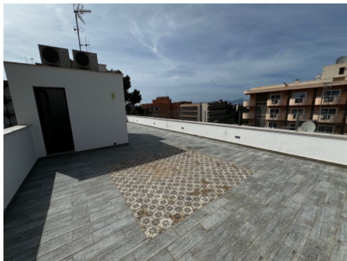
Fantastic roof terrace