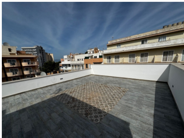
Large roof terrace