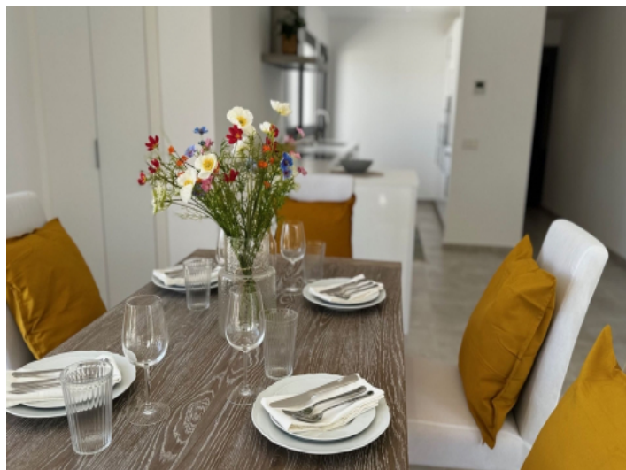
Dining area adjoining the kitchen