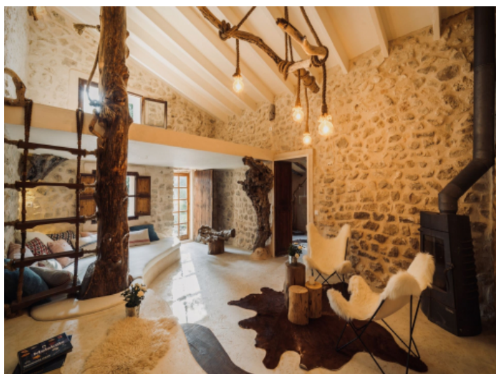
Living area with light and natural stone