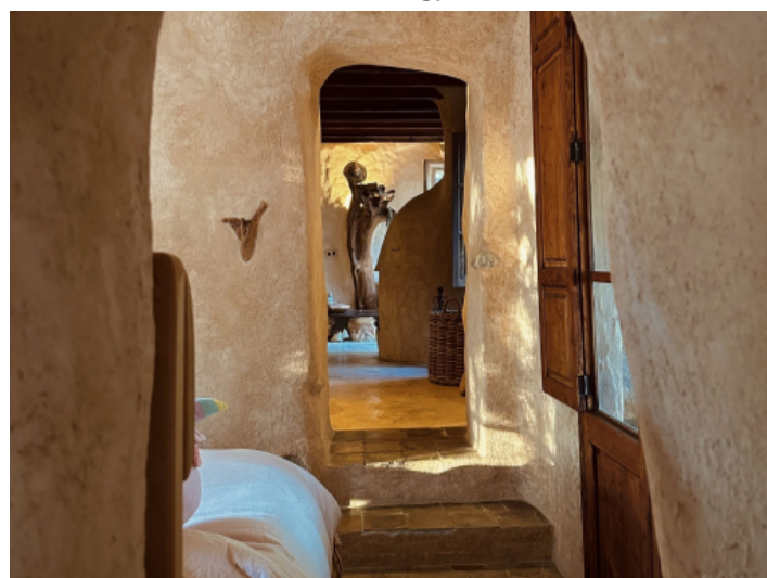
Transition from the bedroom to the living area