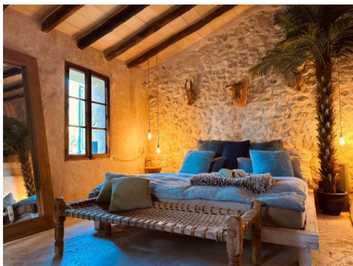
Master bedroom with...