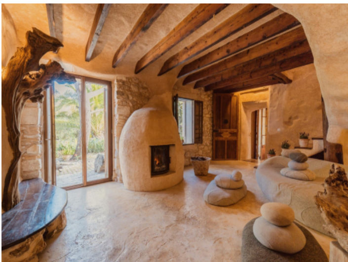
A living space filled with light and soft shapes