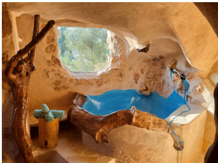
Bathroom with nature-inspired architecture