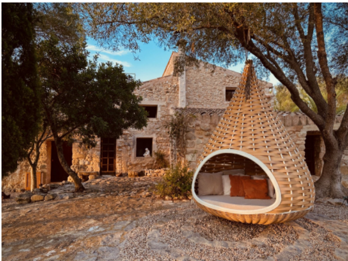
Quiet lounge spot in the garden