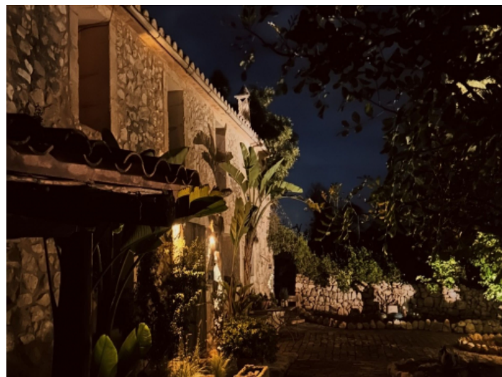
Finca beneath Mallorca's starry sky