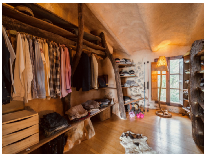
...and a walk-in closet