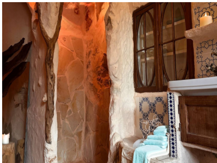
Second bathroom with nature-inspired architecture