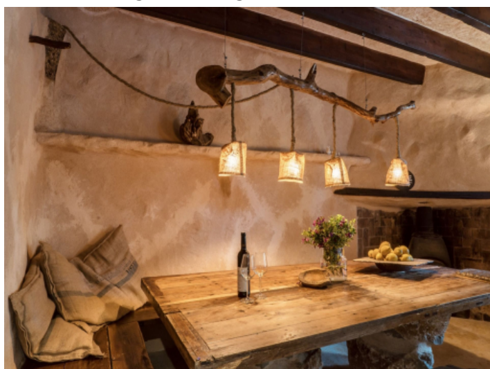
Inviting dining area inside the house