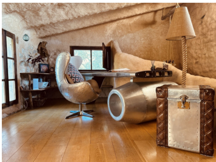
...its own office