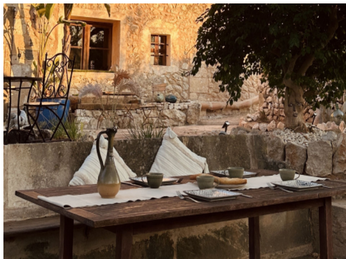
Dinner under the tree