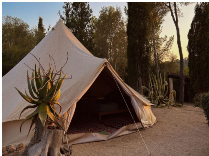
Retreat space in the bell tent