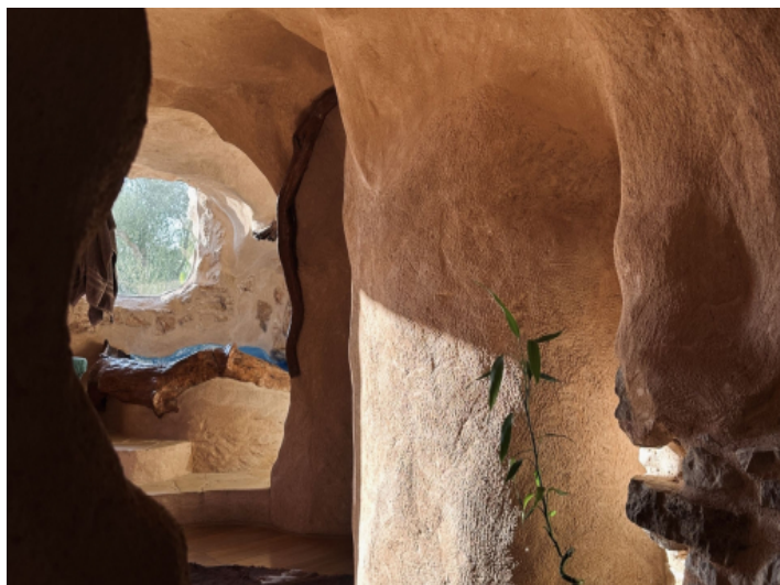
Organic architecture with a view into the bathroom