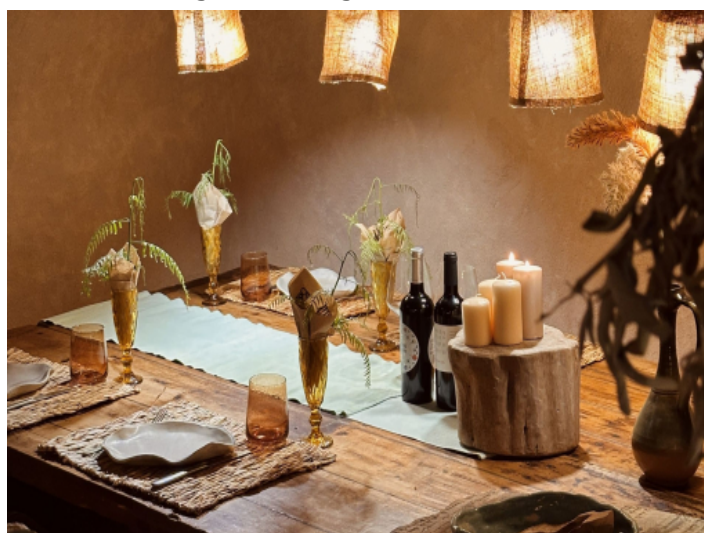
Inviting dining area inside the house