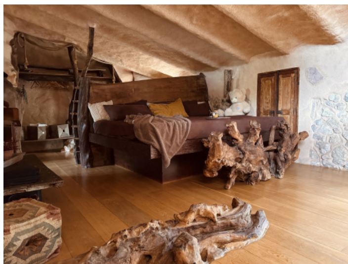
Master bedroom with...