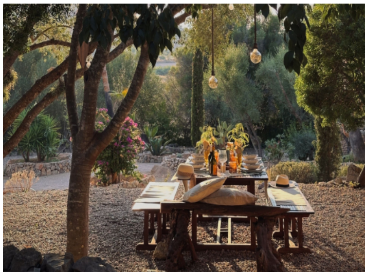
A set table for convivial evenings outdoors