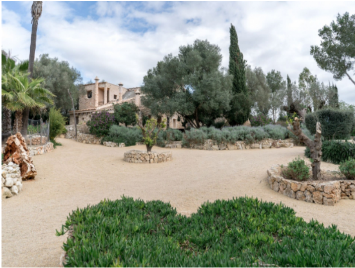
Traditional stone house in a natural setting