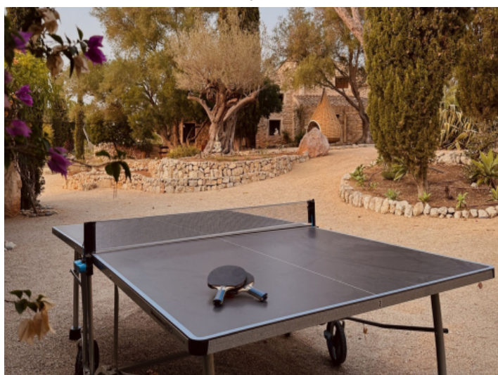
A place for a quick match in between