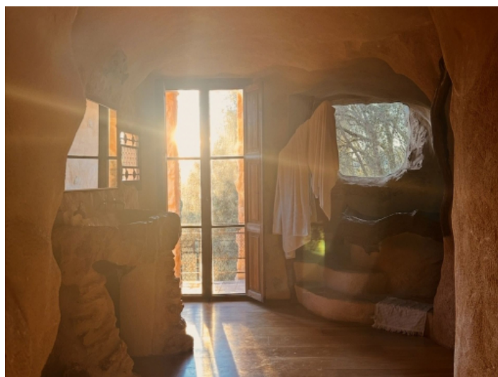
Bathroom with nature-inspired architecture