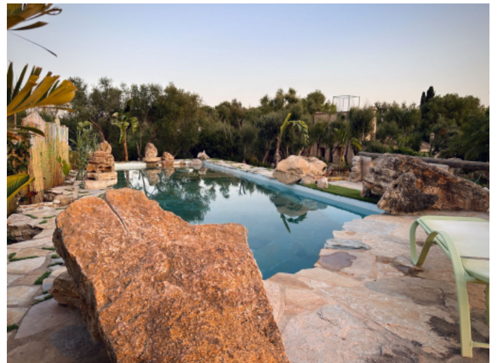
Saltwater pool surrounded by natural stone