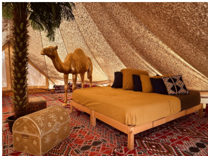
Retreat space in the bell tent