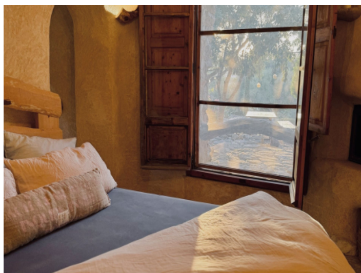
One of the four bedrooms in the house