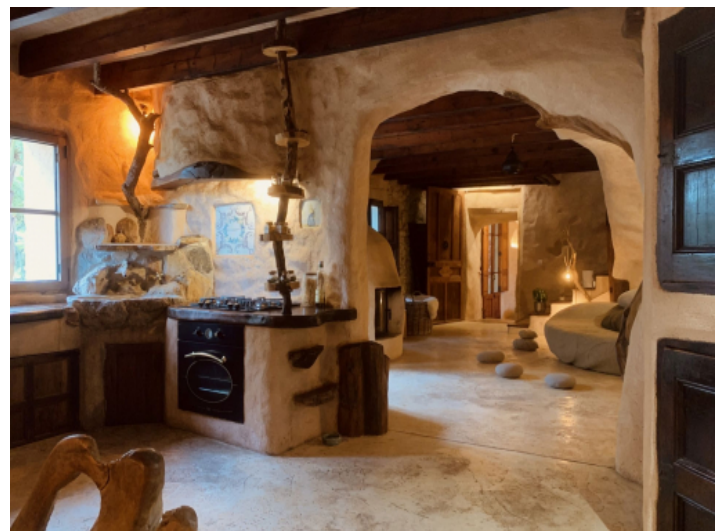
Open kitchen with natural materials