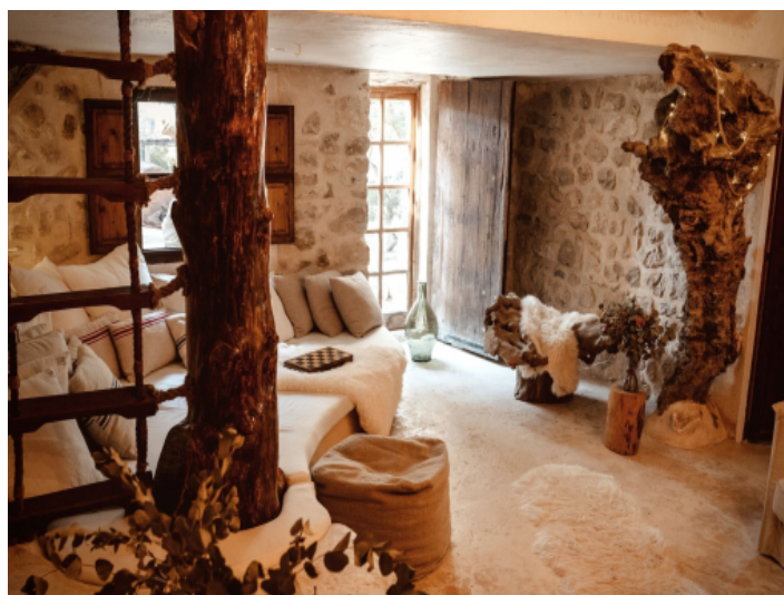
Living area with light and natural stone