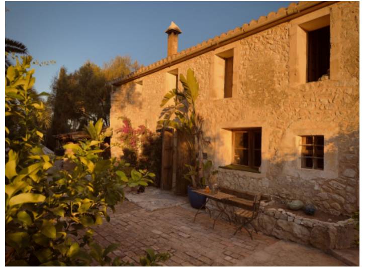
Finca in Sant Joan – A magical oasis of peace and nature