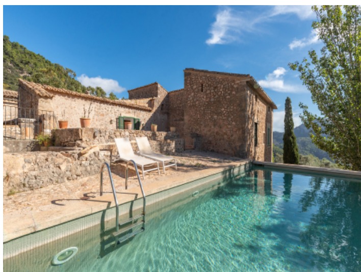
Pool with mountain views