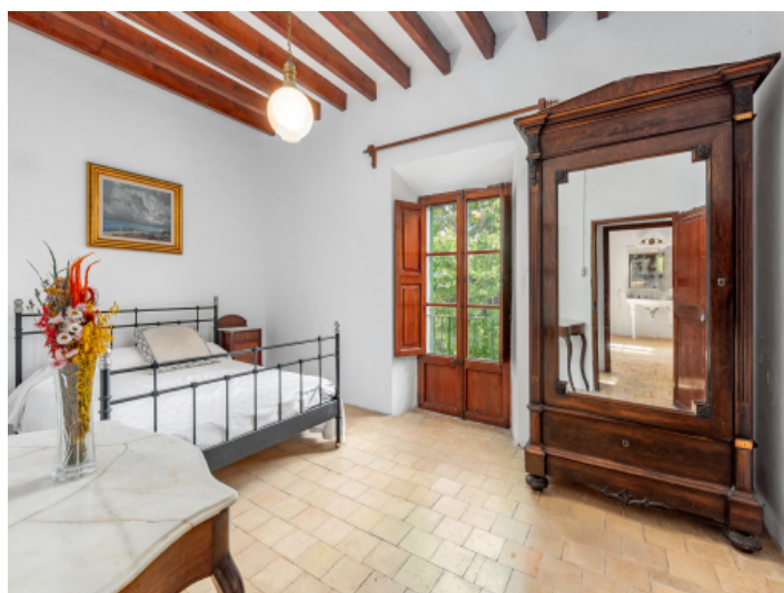
One of 14 bedrooms