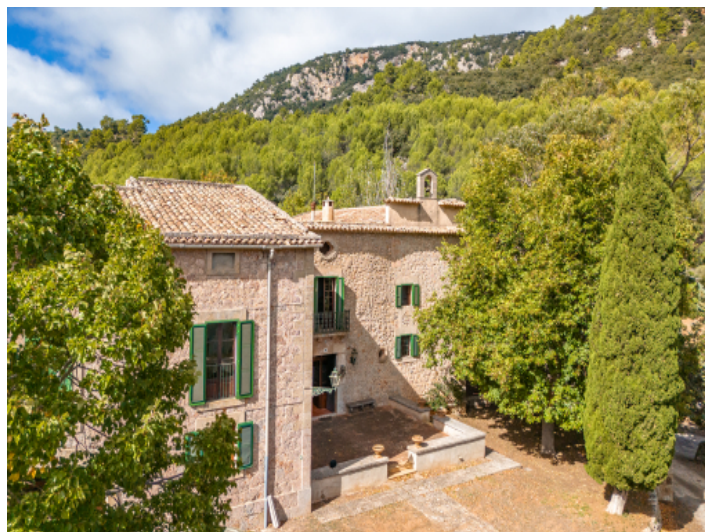
Natural stone façade