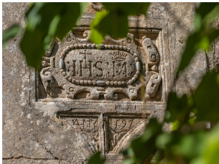
Built in 1597