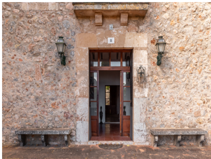
Pristine entrance to the country property

PORTA MALLORQUINA • C./ COLOM 20 2º, 07001 PALMA, SPAIN