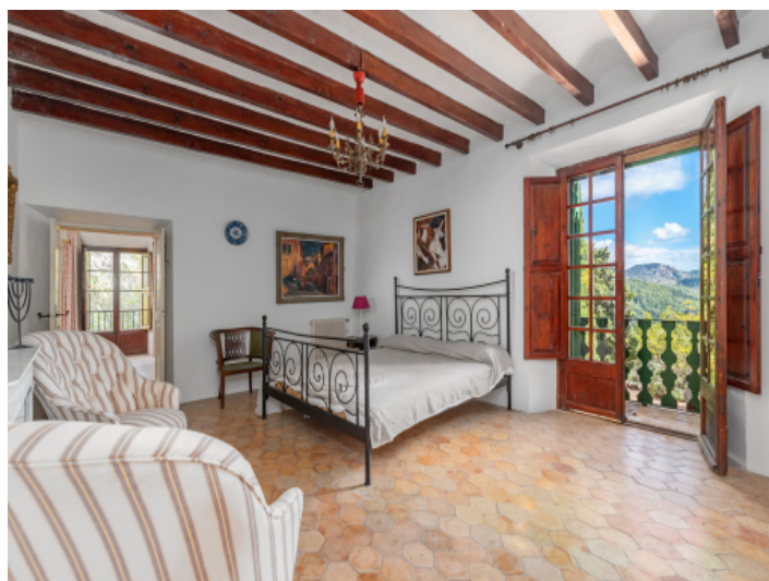
One of 14 bedrooms