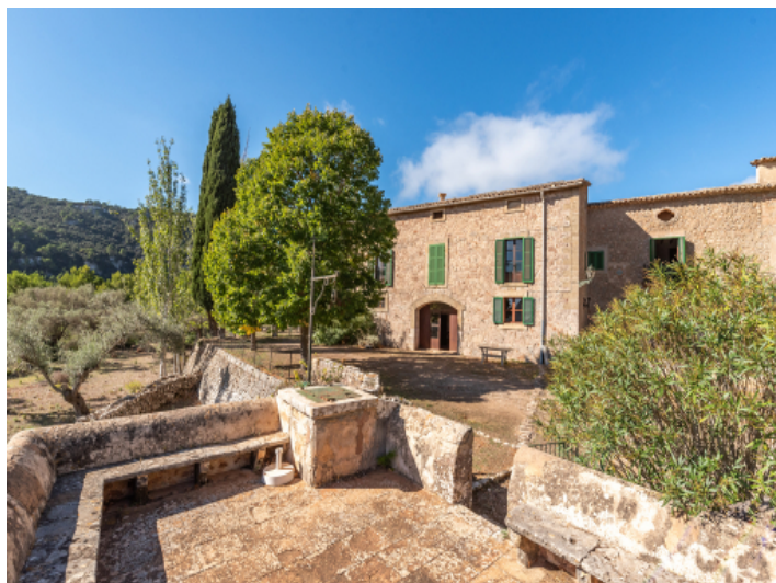
Exterior view of the property