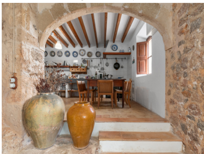
Country kitchen with dining area