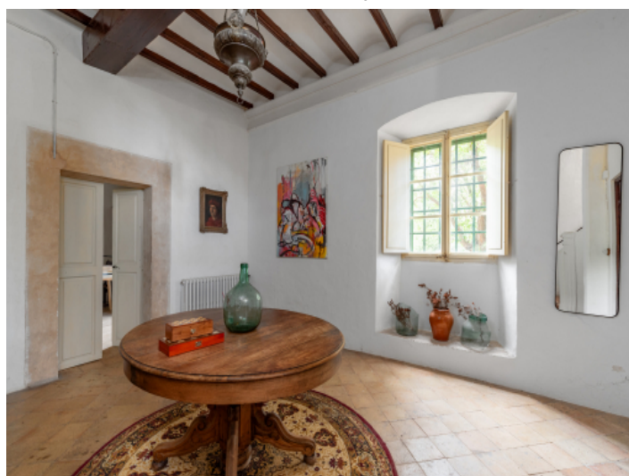
Lovely entrance area