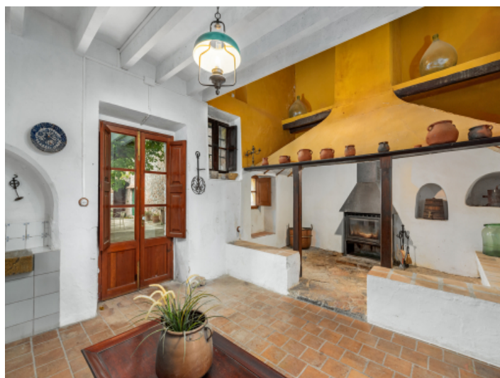
Historical part of the kitchen