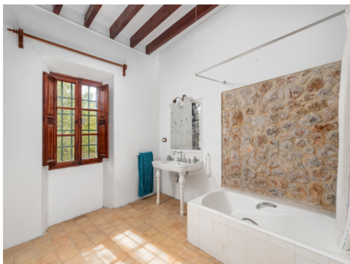
One of 14 bedrooms