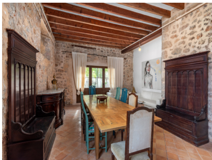
Dining area with antiques