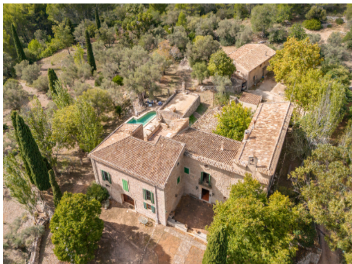
Nestled in the Tramuntana mountains