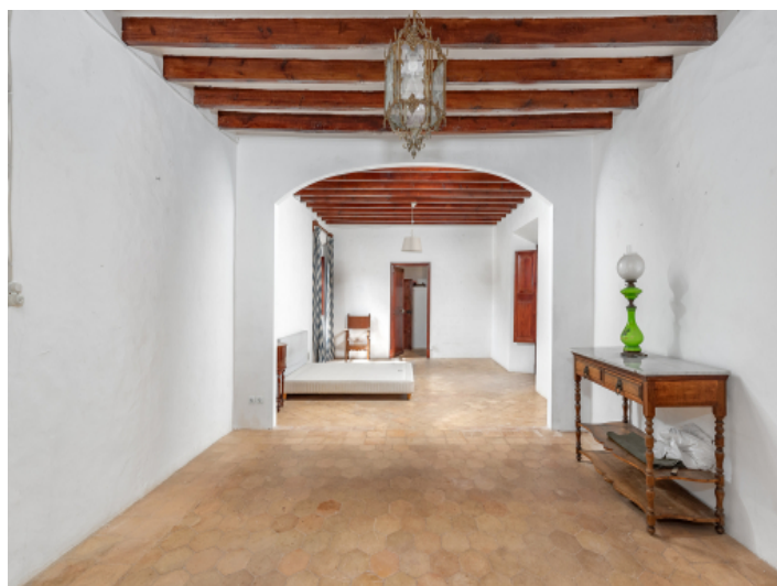
One of 14 bedrooms