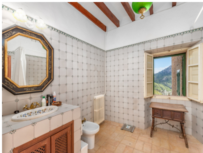
One of 7 bathrooms