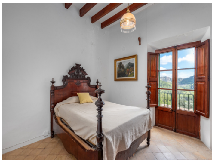
One of 14 bedrooms