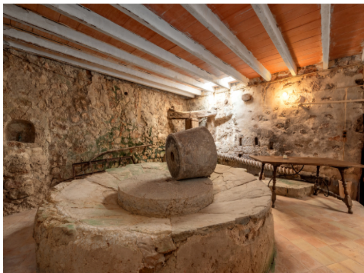
Historic olive press