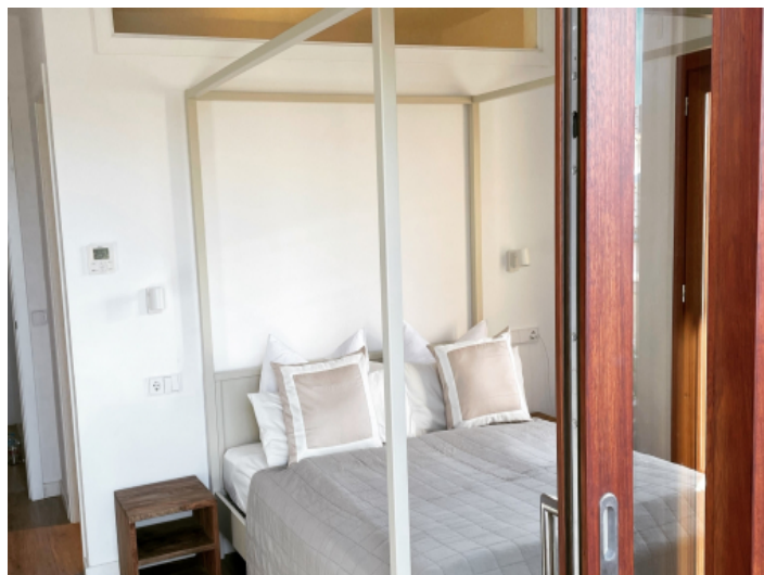
Townhouse with 3 bedrooms