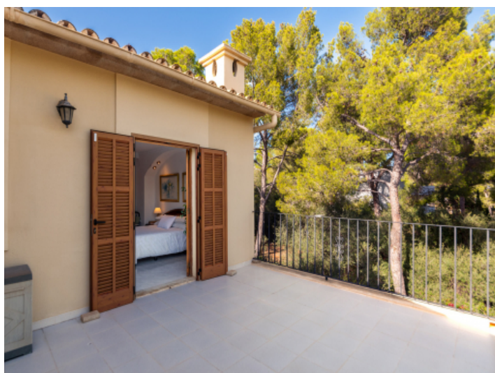
Terrace off a bedroom