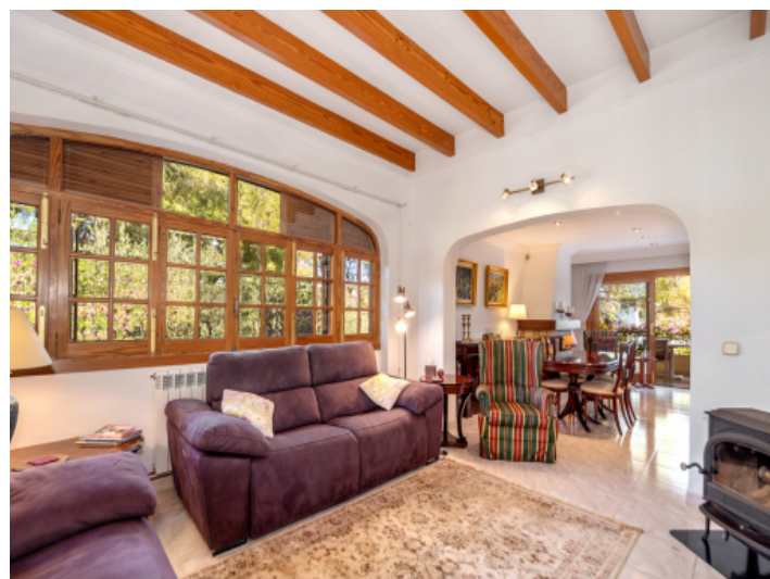
Open plan living and dining area