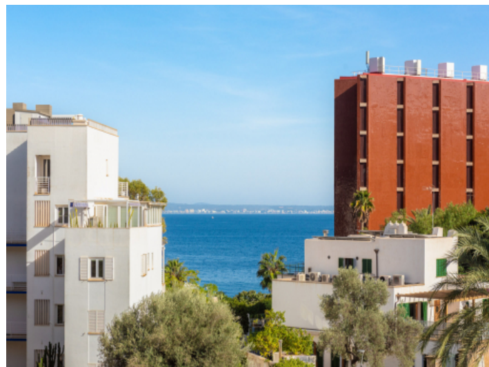
Partial sea view