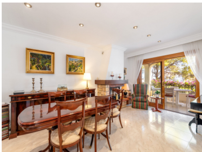
Dining area with fireplace and access to a terrace