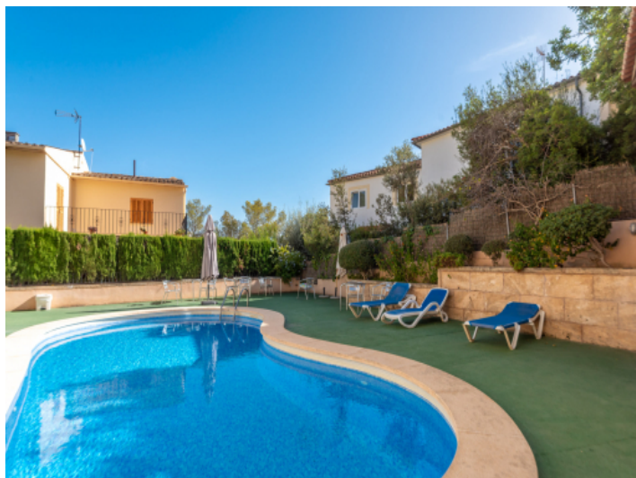
Large pool area