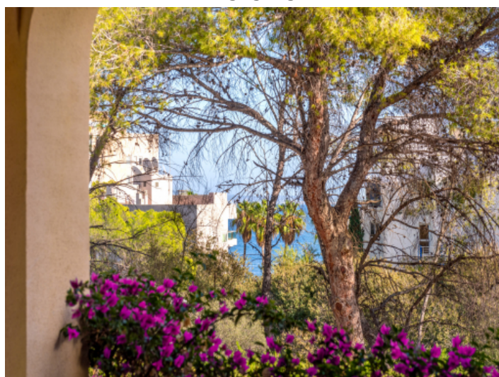
Partial sea view