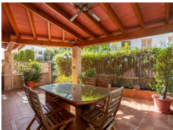
Covered terrace with outdoor dining area