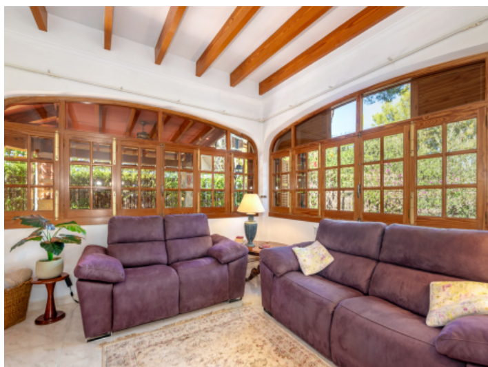
Living area with wooden beams