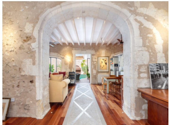
View to the living area