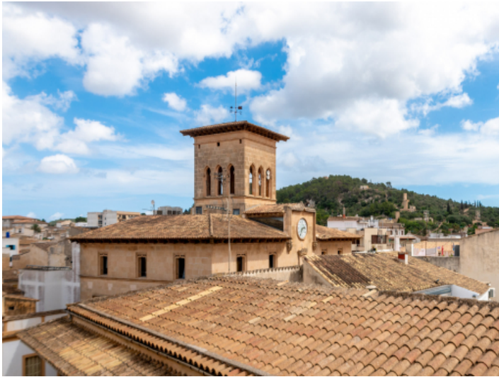
Rooftop terrace with great views