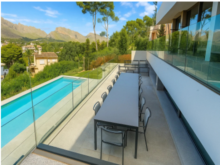
Dining area right by the pool