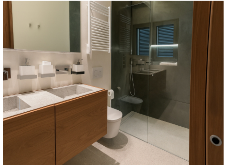
Bathroom of the second double bedroom