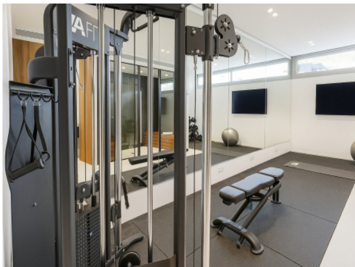
Gym on the ground floor