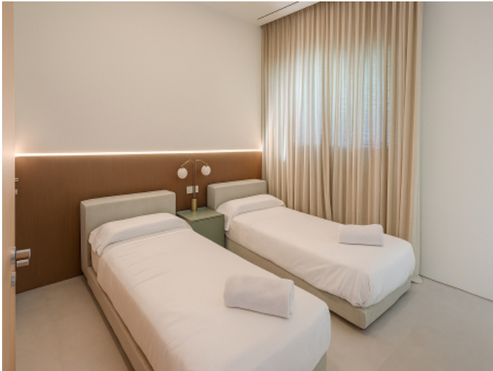
Second double bedroom on the upper floor