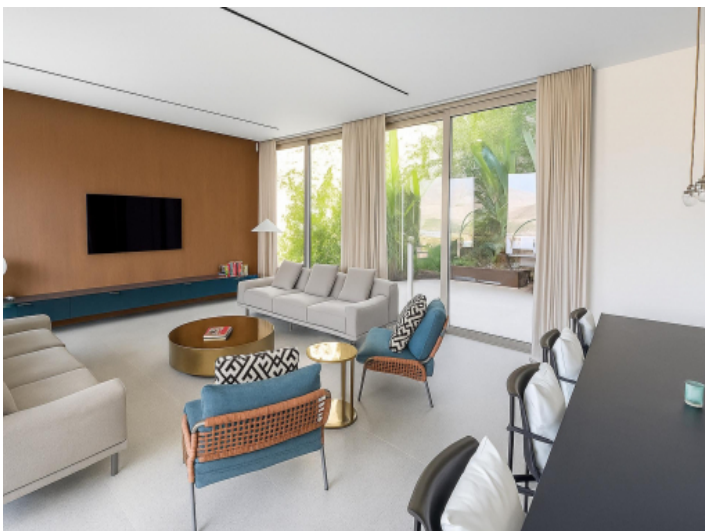
Living room on the entrance level