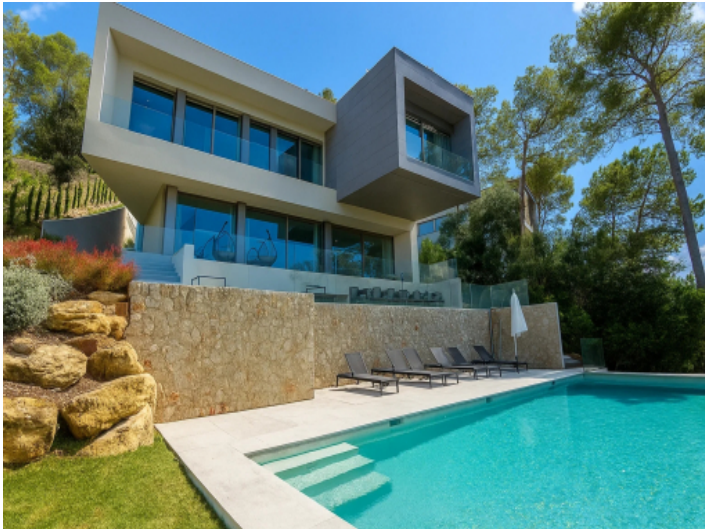
Minimalist villa in Gotmar