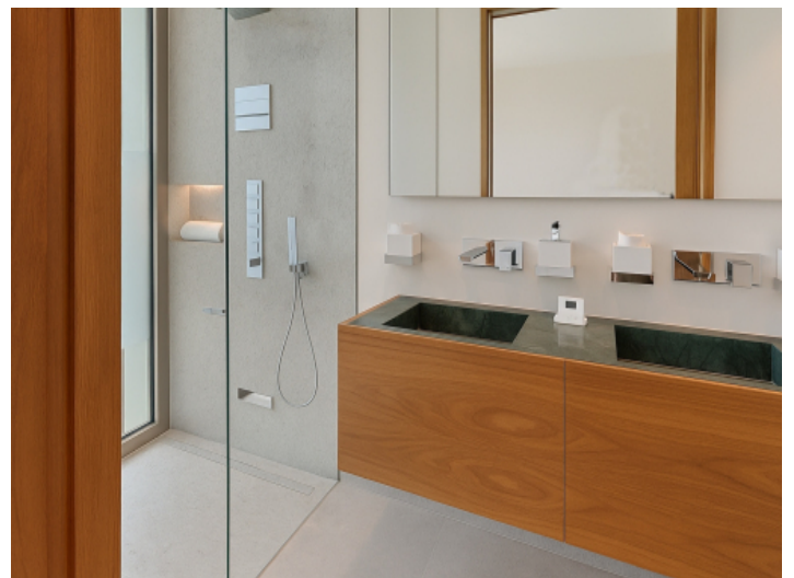
Bathroom of the fourth double bedroom