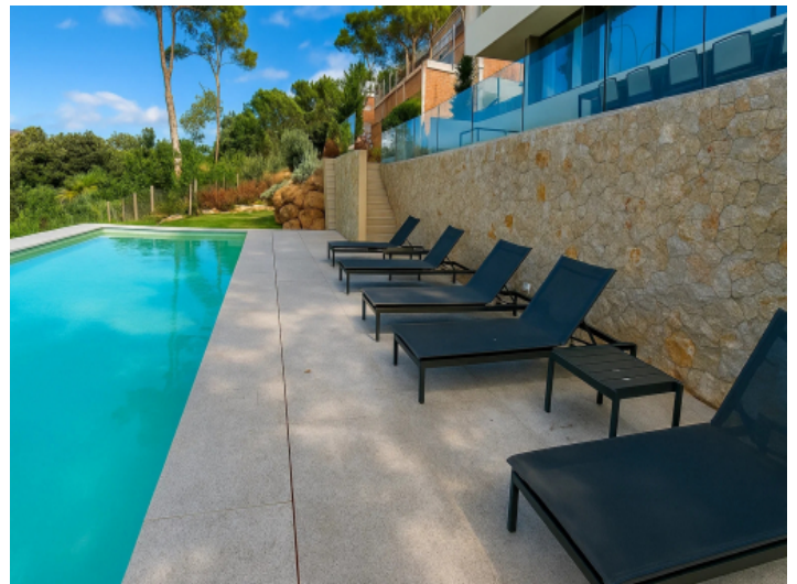
Sun terraces by the pool