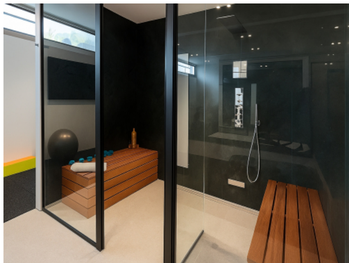
Integrated sauna in the gym