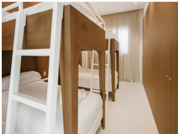
Children's bedroom on the upper floor