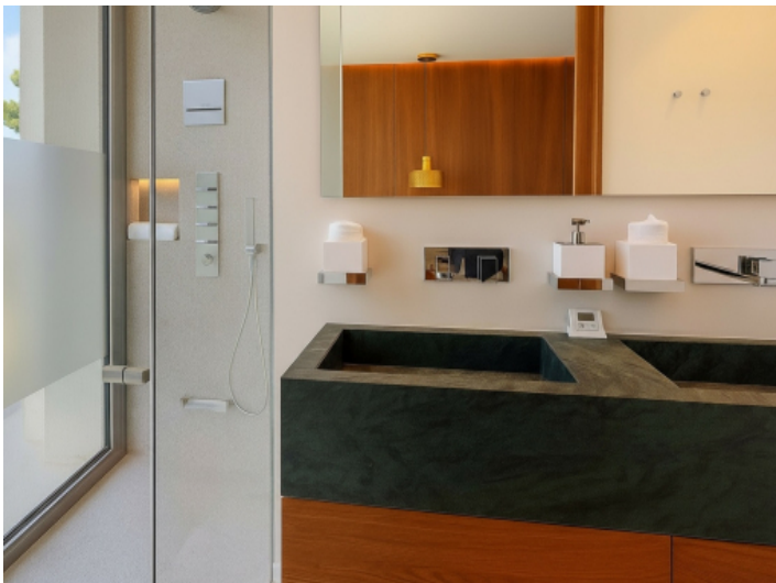
Bathroom of the fifth double bedroom