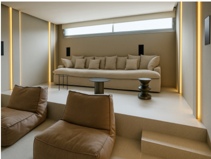
Home cinema on the ground floor