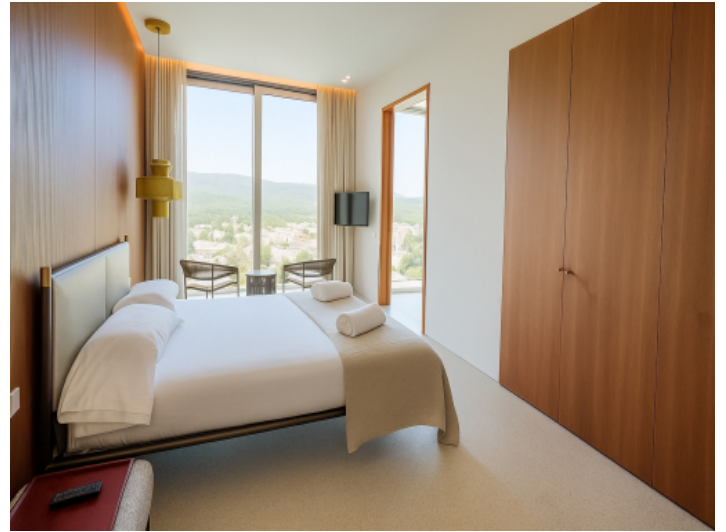
Fifth double bedroom on the upper floor