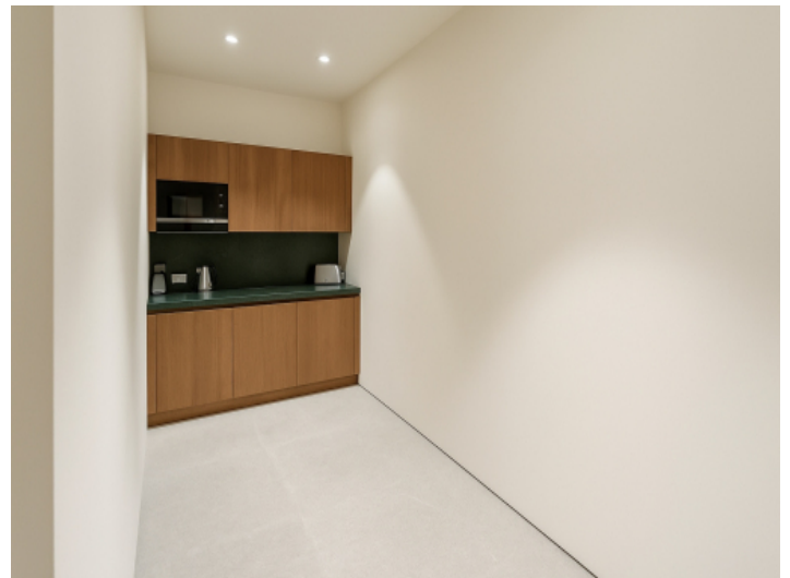
Kitchen on the ground floor