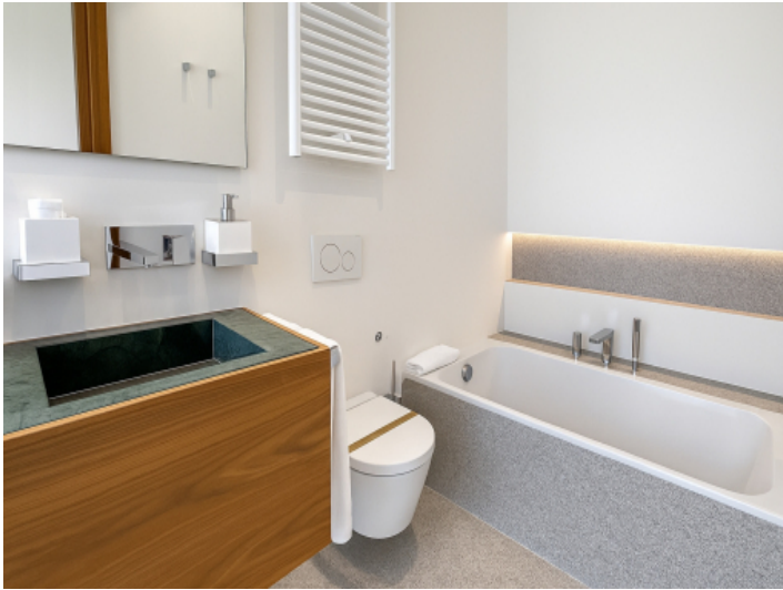
Bathroom of the fourth double bedroom