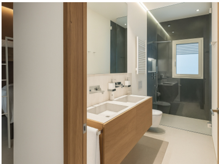
En-suite bathroom of the children's room