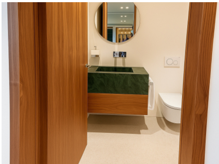
Bathroom in the gym