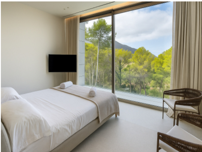
Third double bedroom on the upper floor