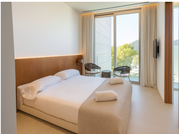
Fourth double bedroom on the upper floor