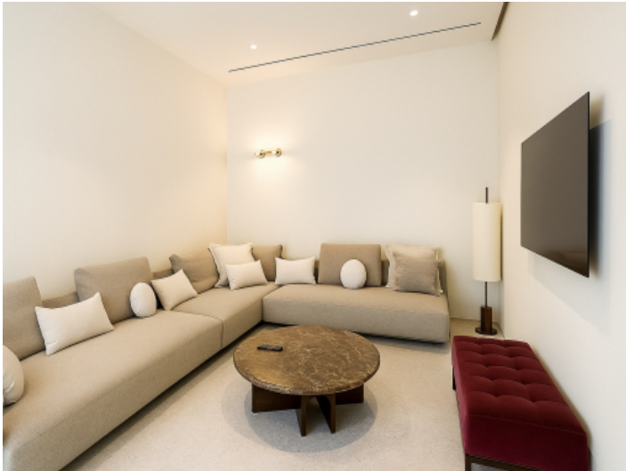
TV room on the entrance level