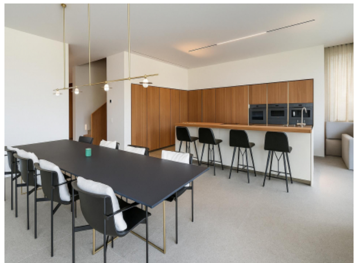
Dining area and kitchen on the entrance level