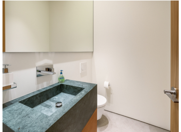
Guest toilet on the entrance level