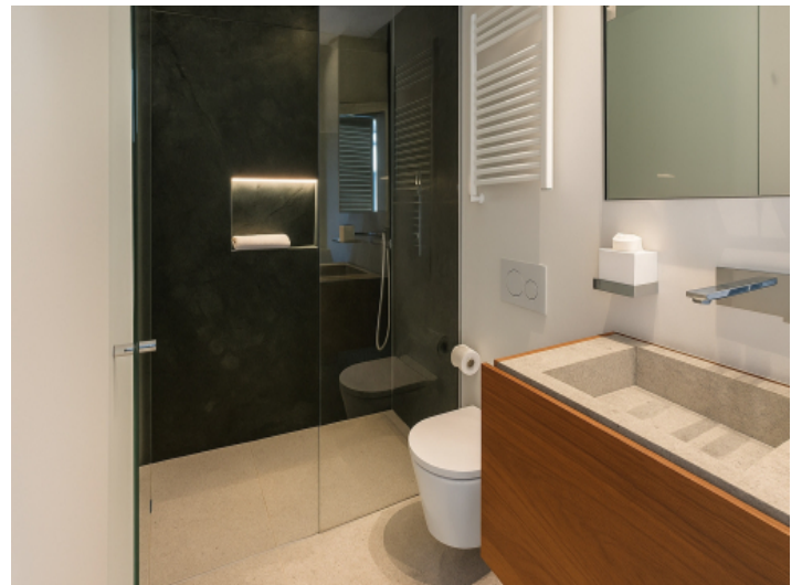
Bathroom of the third double bedroom