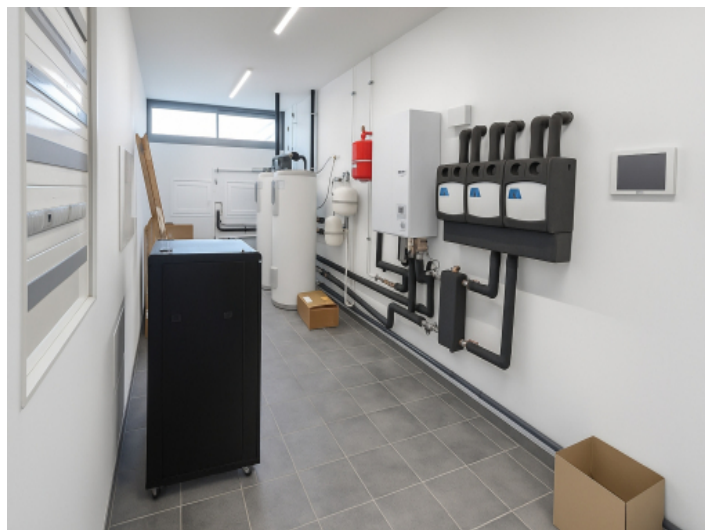
Technical room on the ground floor