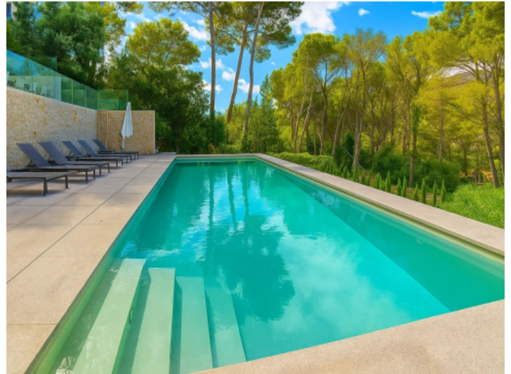
Swimming pool framed by sun terraces