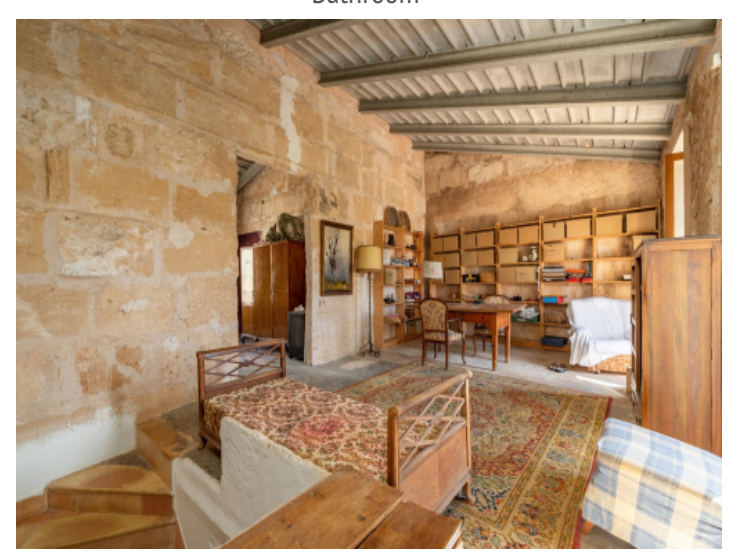
Hall first floor