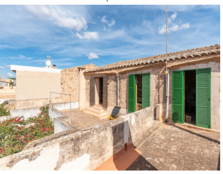
Terrace first floor