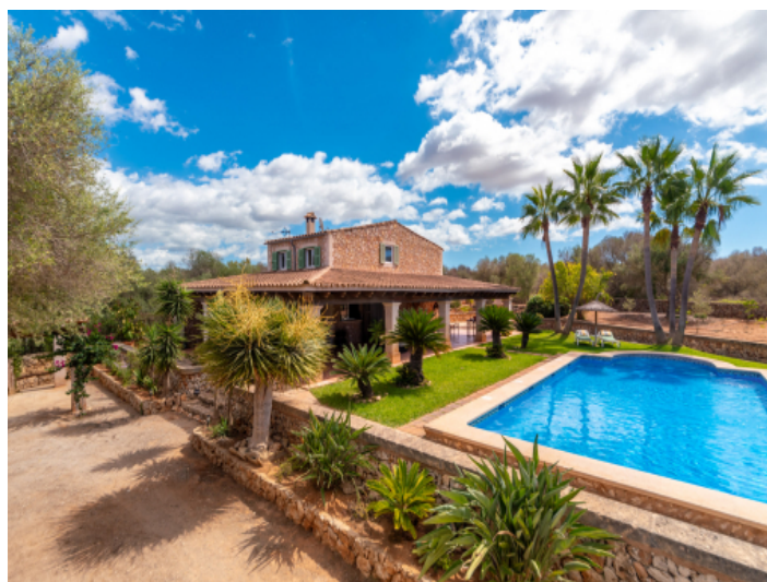
View to the finca