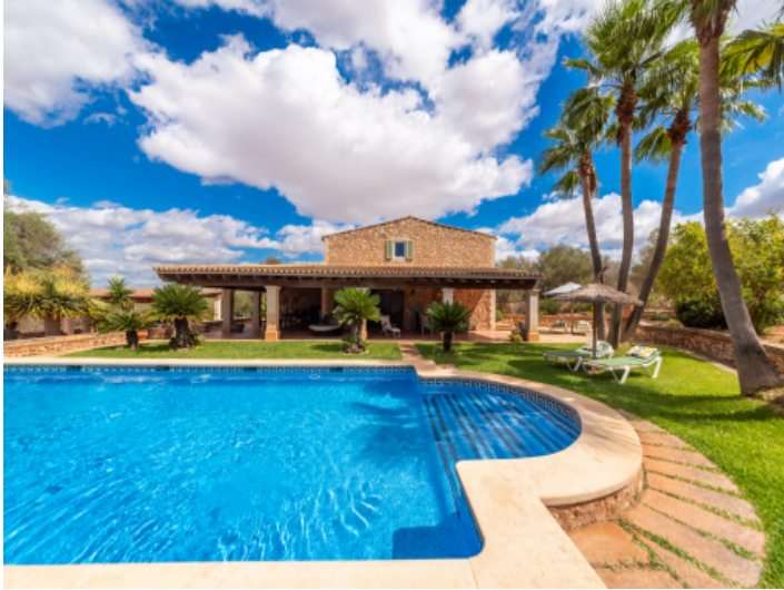
Garden and pool