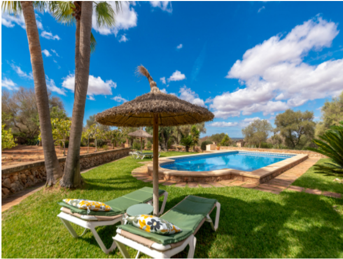
Very nice pool and garden area