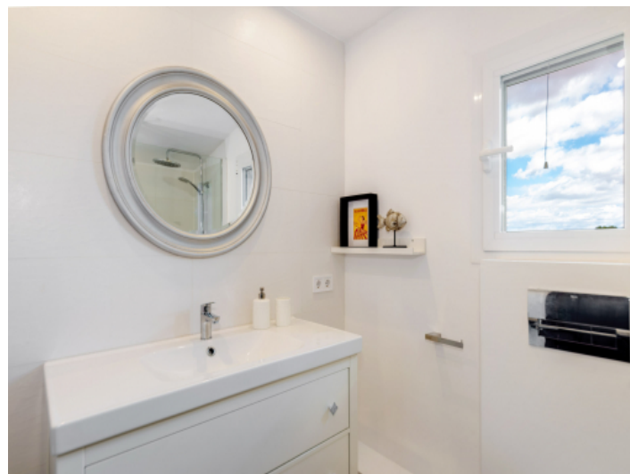
En suite bathroom