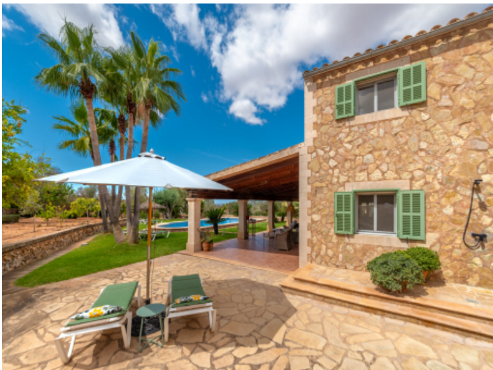
View to the lateral façade and garden