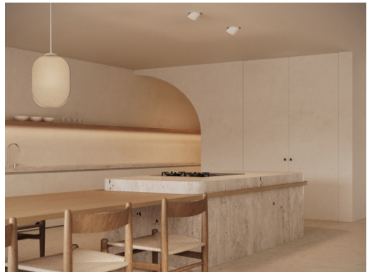
Nice cooking island