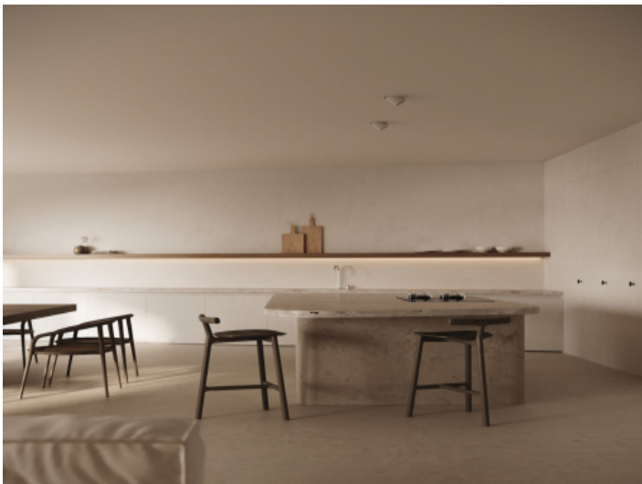
Stylish kitchen with