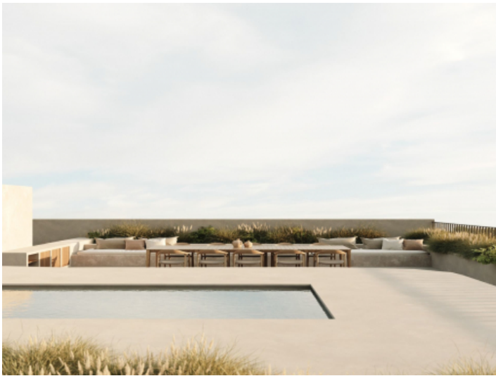
Beautiful Pool in the patio