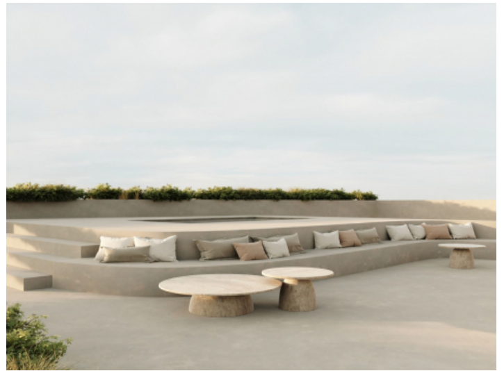
Relax close to the jacuzzi on the rooftop