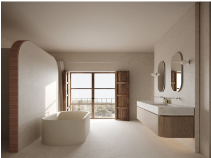
Three luxury bathrooms