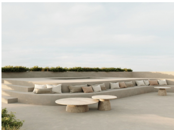
Sitting area close to the jacuzzi on the rooftop