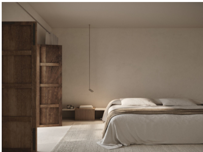
Townhouse with 3 bedrooms