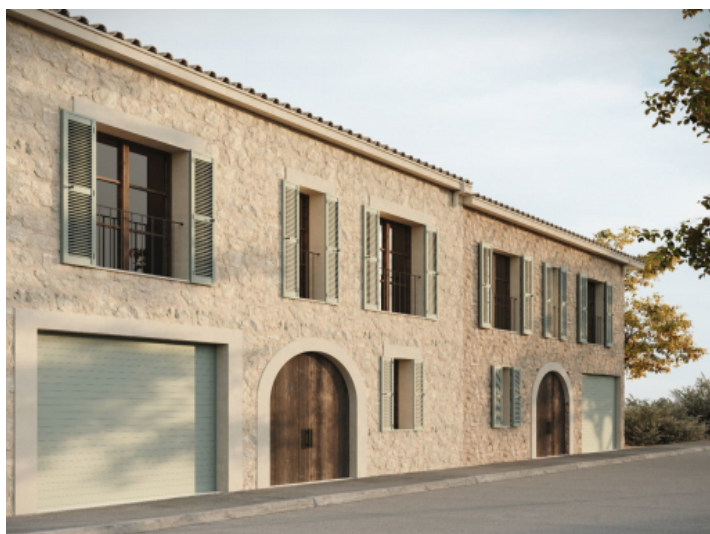
Exclusive new-build townhouse with pool and roof terrace in