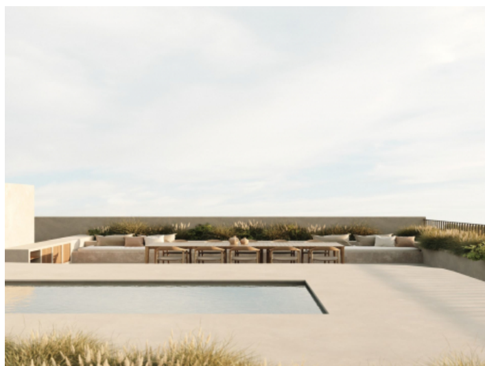
Pool area in the patio