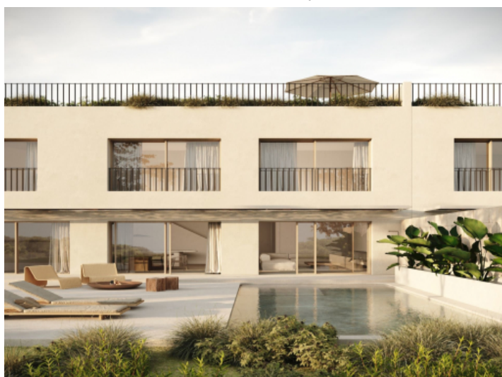
Beautiful townhouse with garden and pool