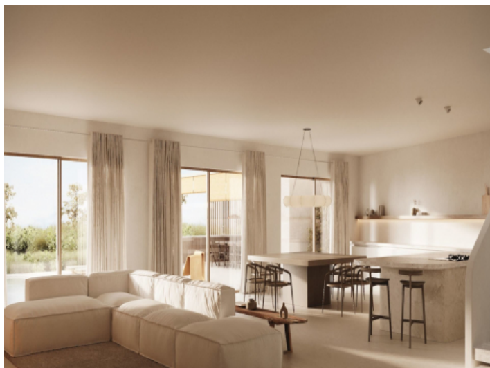
Elegant living area