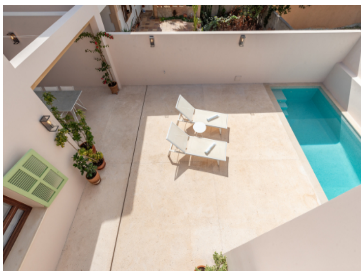
View to the pool