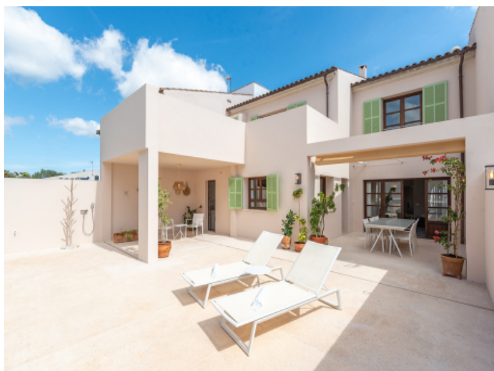
Newly renovated townhouse on the outskirts of Arta with