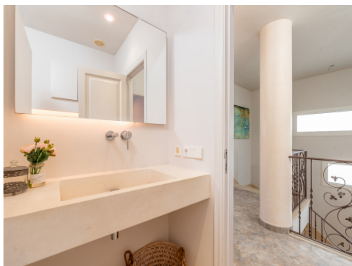
Bathroom on the first floor