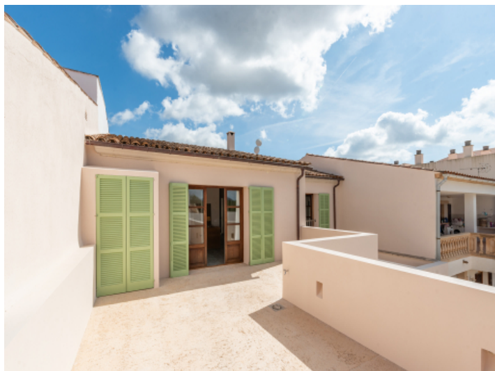
Terrace on the first floor