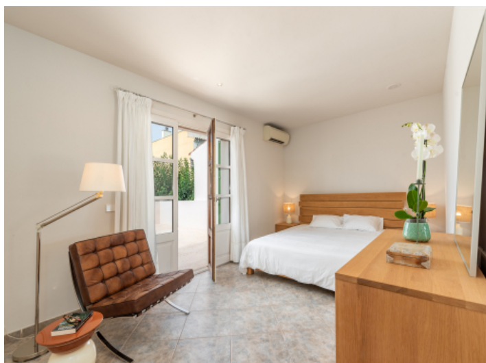
Mastersuite on the first floor