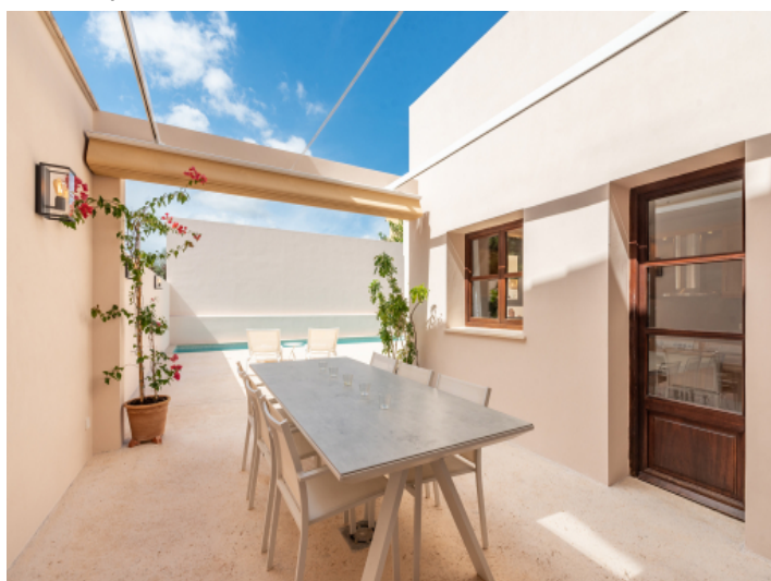
Outdoor dining close to the kitchen