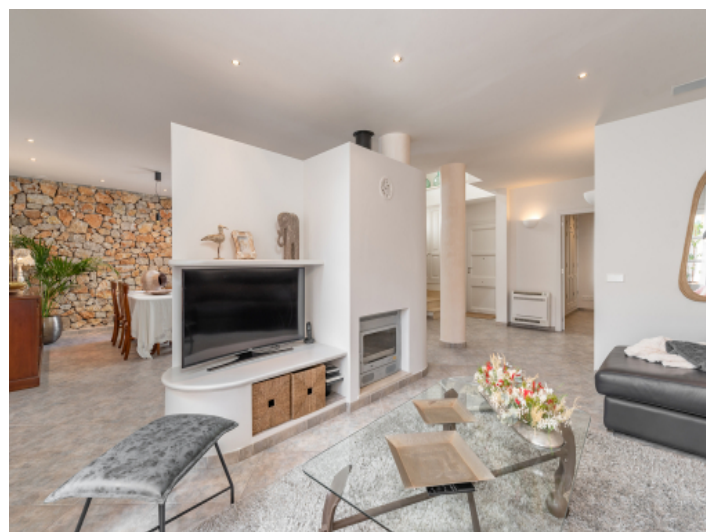
Comfortable living area