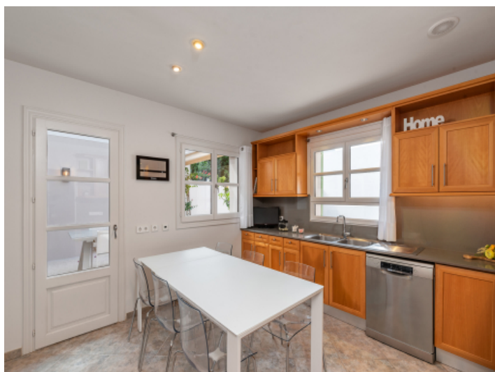
Kitchen with patio access