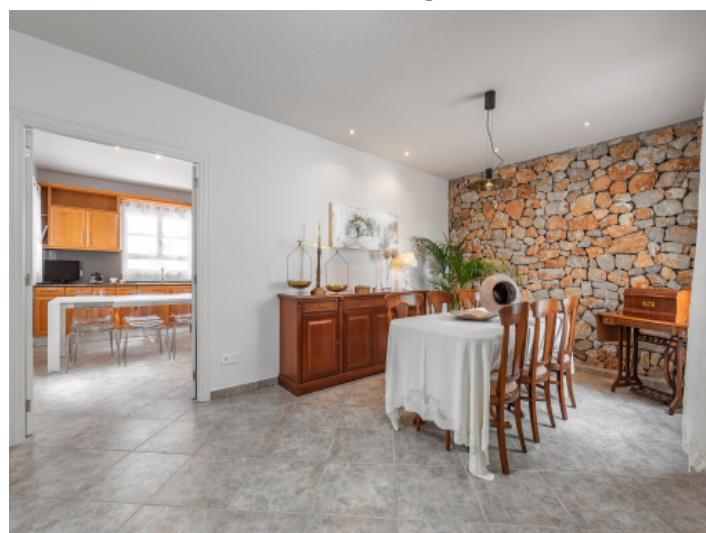
Dining area with natural stone wall