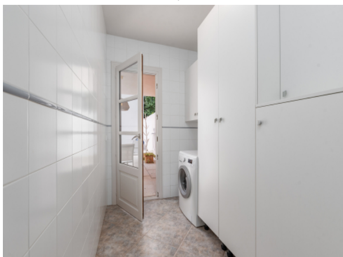
Separate utility room