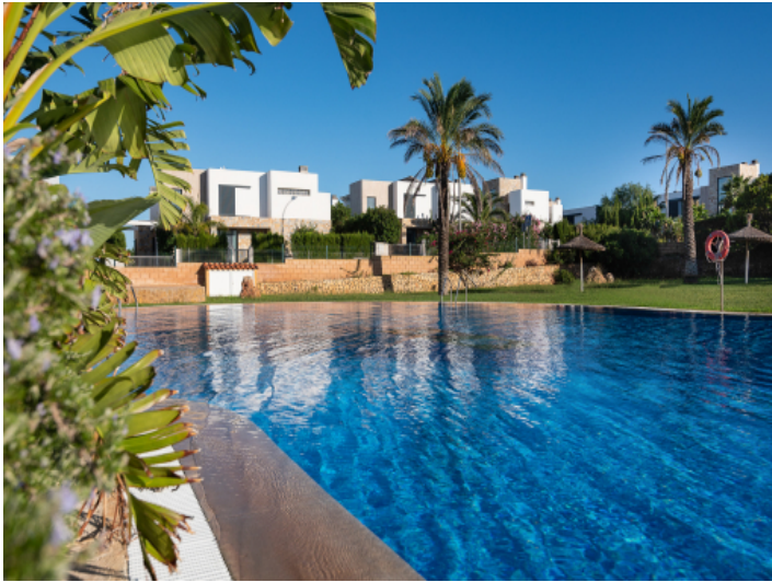
Mediterranean oasis of well-being-charming villa with private