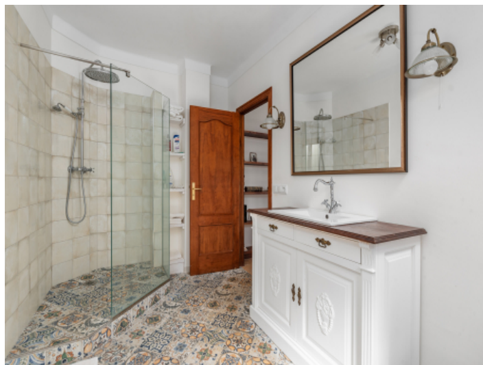
Bathroom en suite