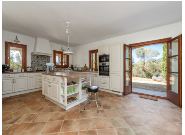
Large country style kitchen