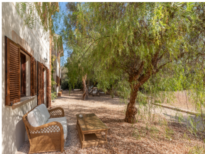
Beautiful spot in the garden