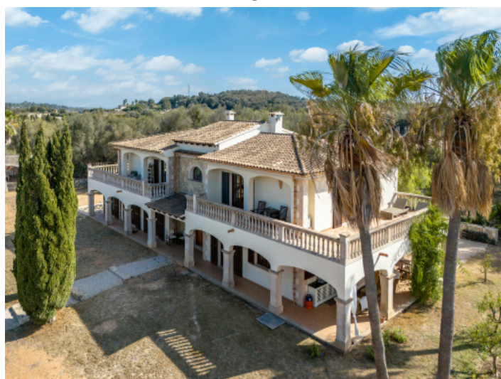
View to the property