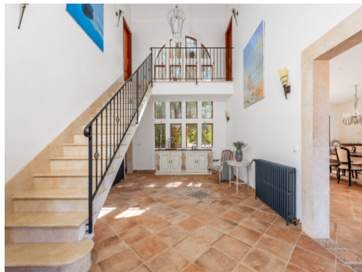
Large entrance hall