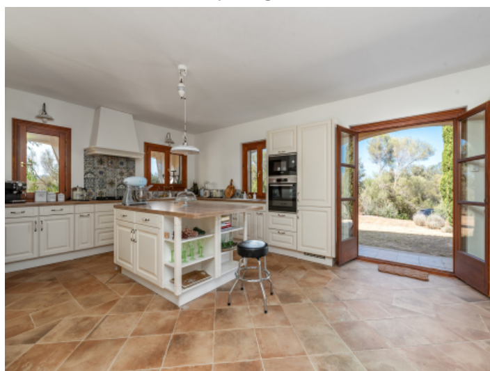
Large country style kitchen