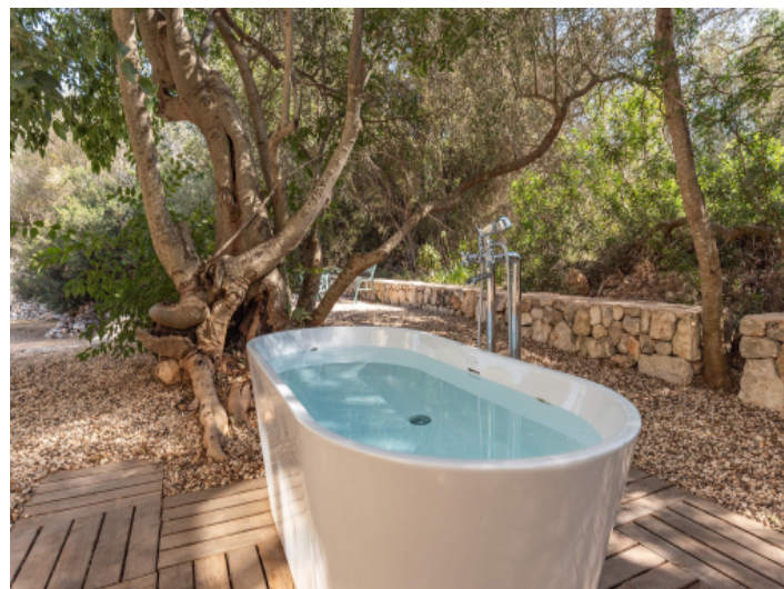
Refreshing cooling in the garden