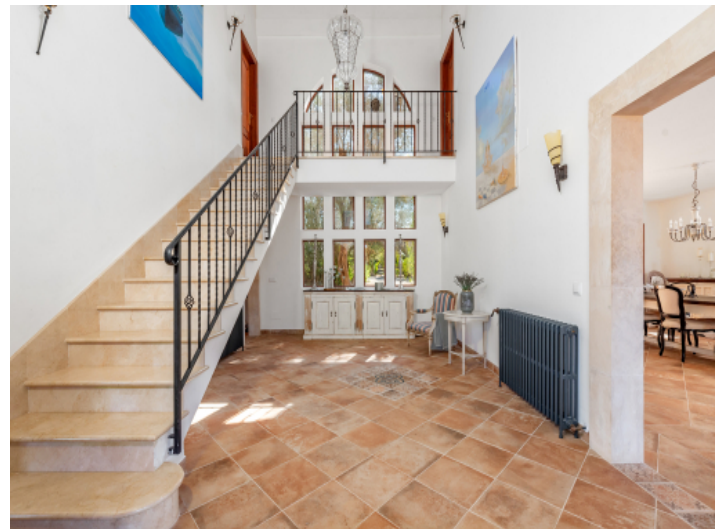
Large entrance hall