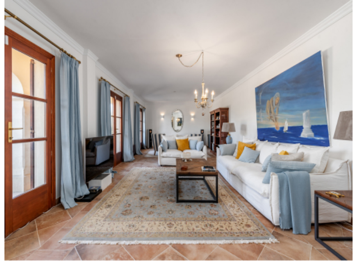
Cozy living area