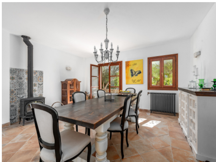
Dining area with fireplace