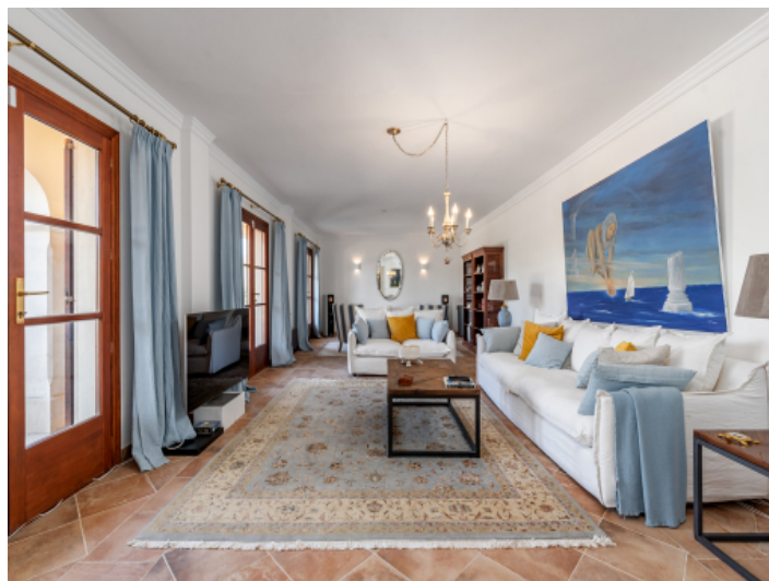
Cozy living area