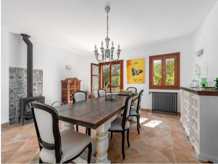
Dining area with fireplace