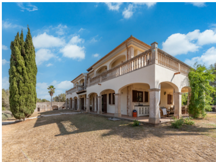
View to the property