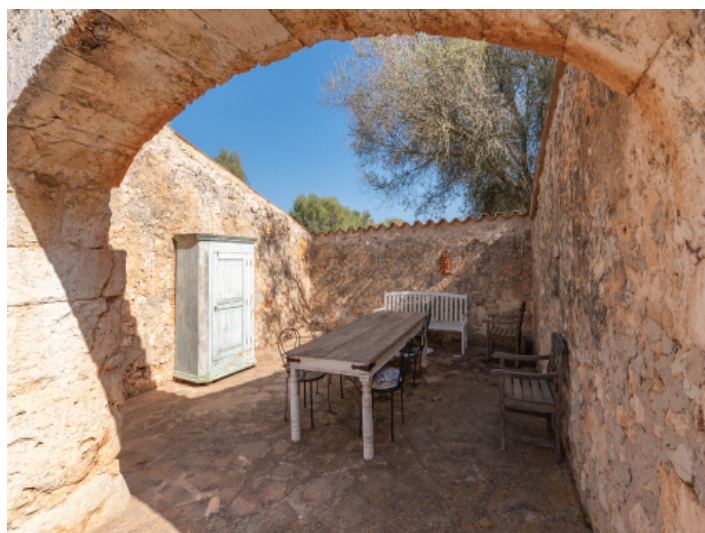
Outdoor dining area