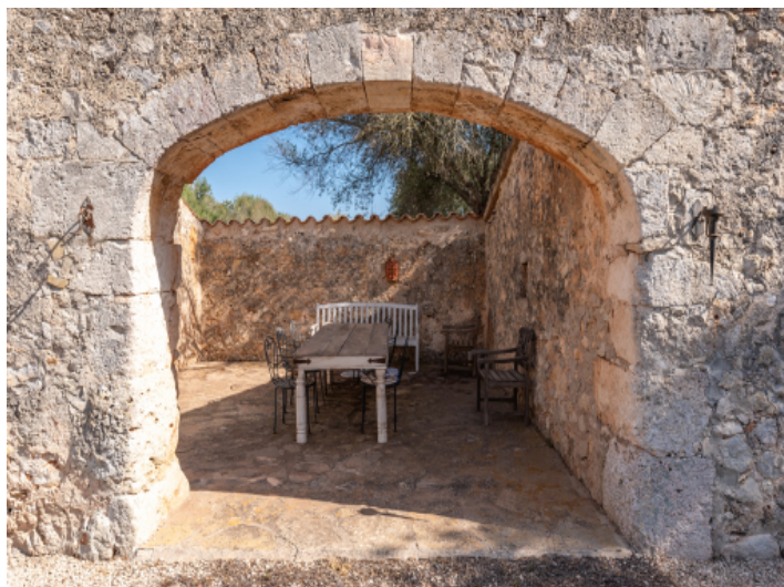
Romantic outdoor dining