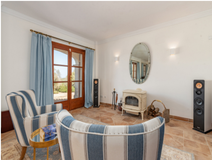
Living room with fireplace