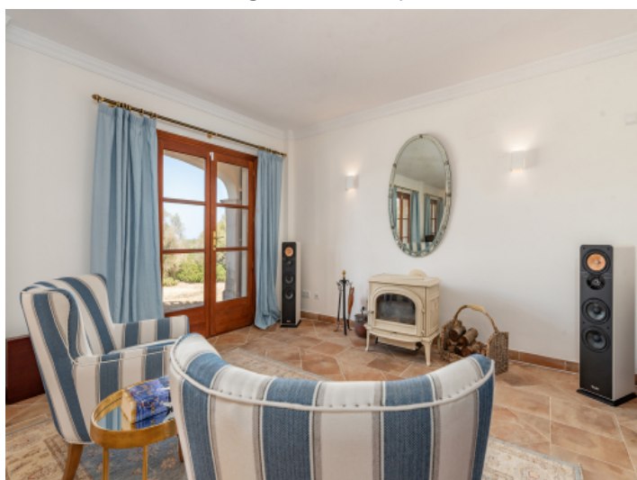
Living room with fireplace