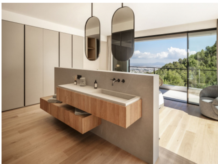
Wash basin in the bedroom