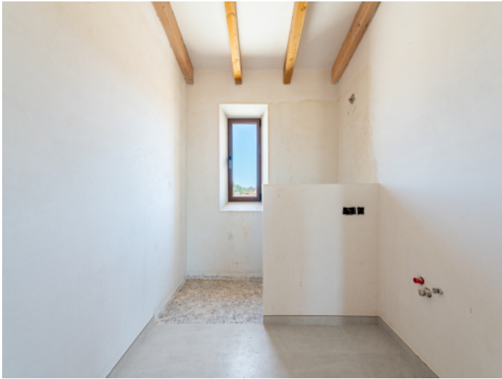
There are a total of 4 bathrooms