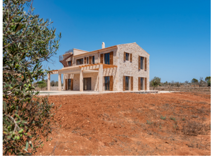
View to the property