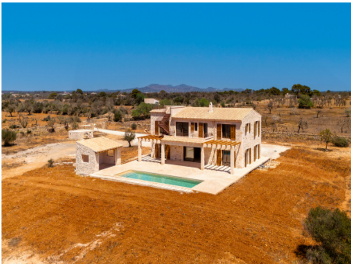
Very nice finca