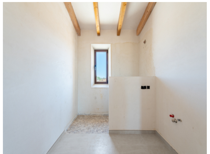
There are a total of 4 bathrooms