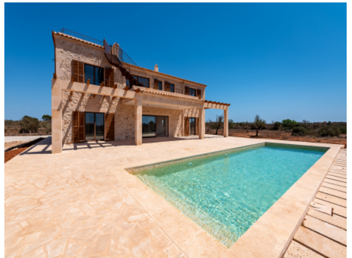
Facade and pool