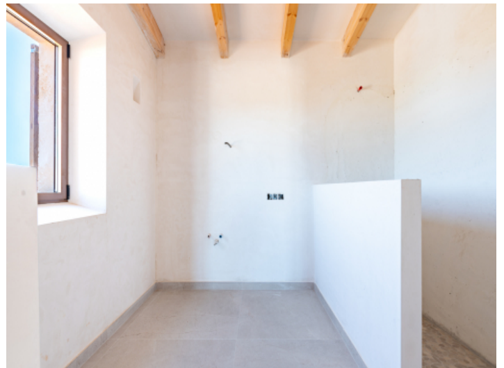
One of 4 bahtrooms