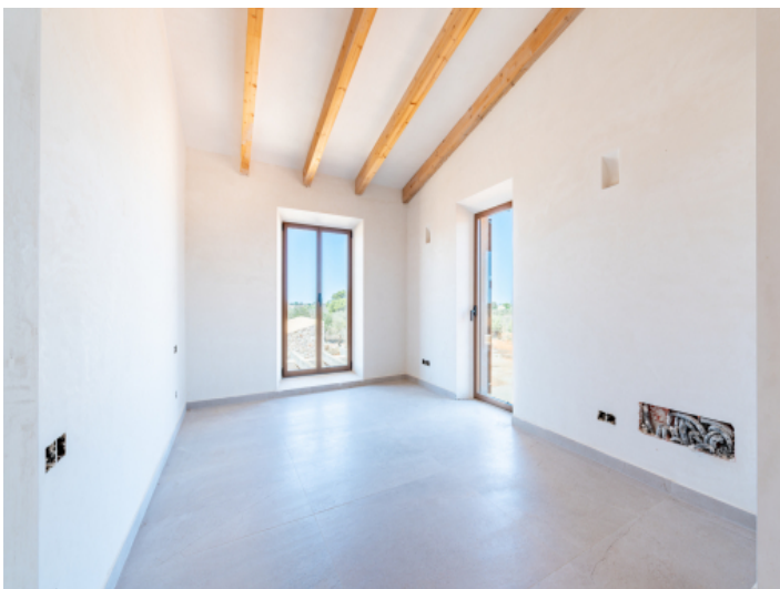
One of 4 bedrooms o