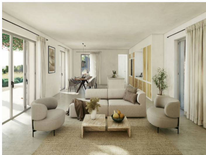
Modern interior design