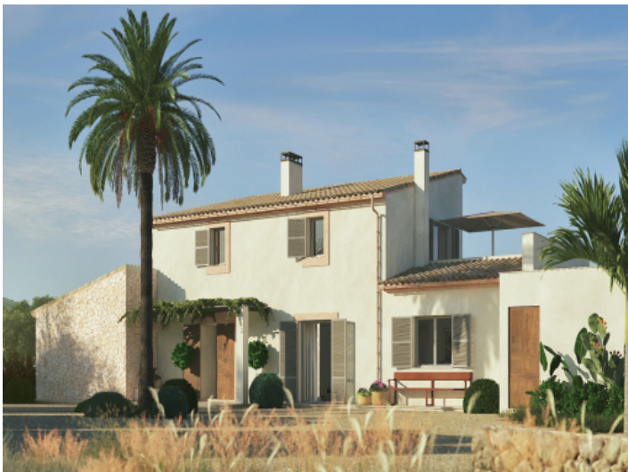
View to the finca project