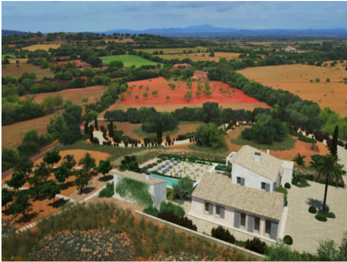
Aerial view to the Project