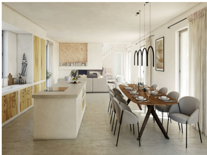
Large kitchen and dining area