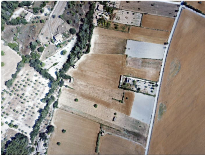
Aerial view of the plot