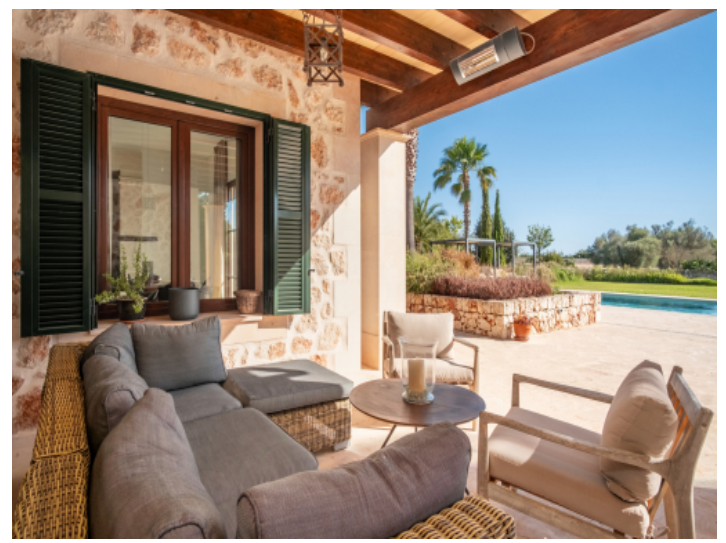
Lounge area Terrace