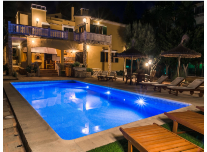
Beautiful property at night