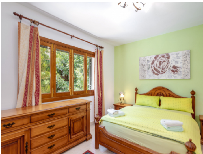
One of 7 bedrooms