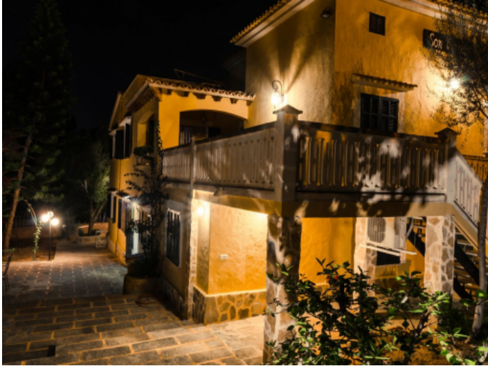
The property by night