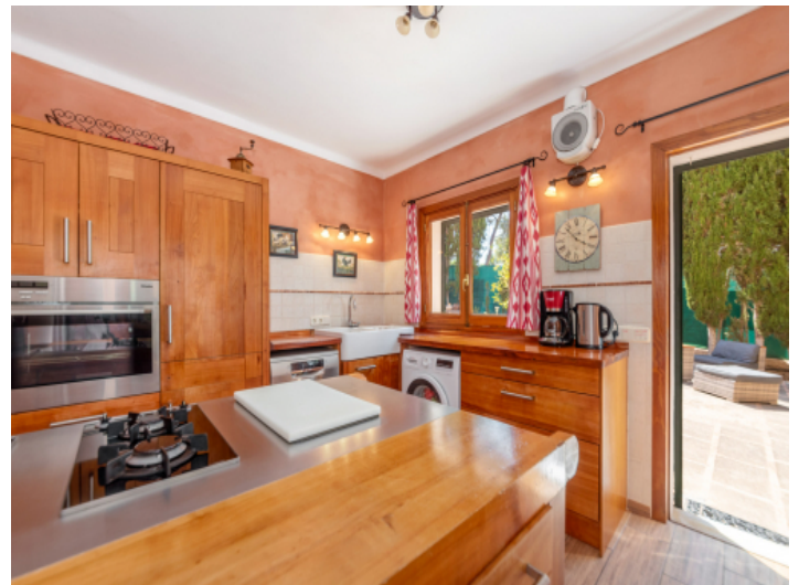
Country style kitchen