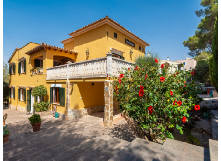
View to the property