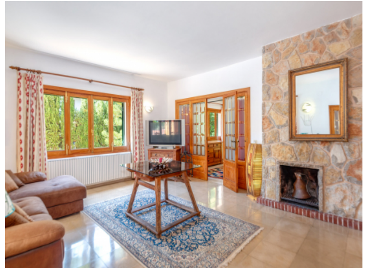
Another living area