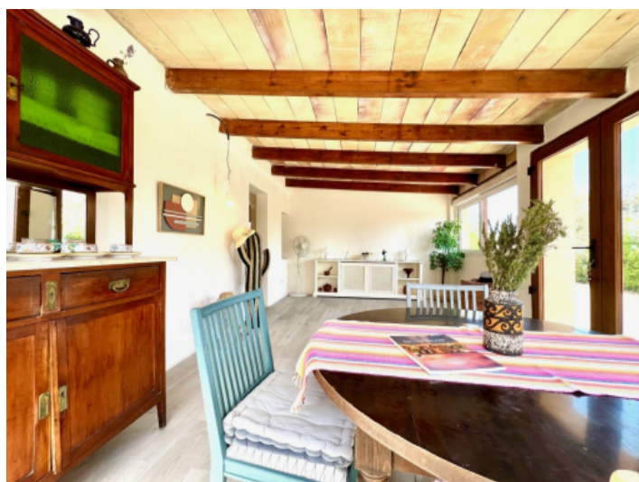
Charming dining area