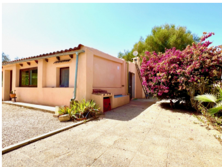
Refurbished finca in Llucmajor