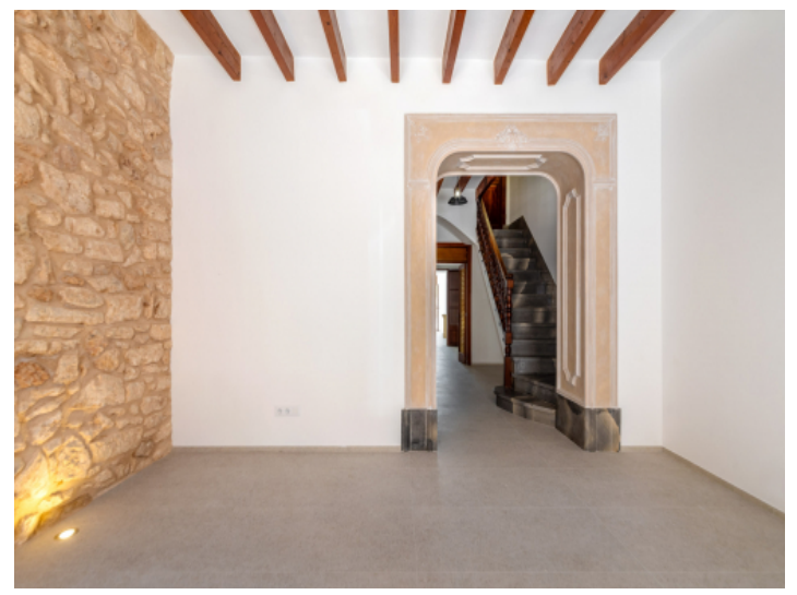
Living area and staircase to the first floor