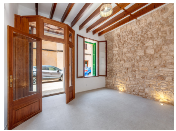
Typical entrance to a Mallorcan village house