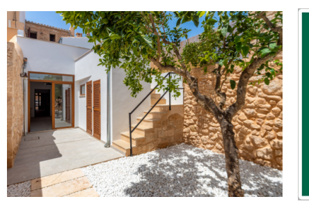
Llucmajor search for property MAL-121714