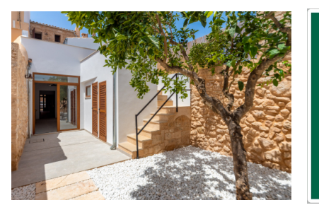
Llucmajor search for property MAL-121714