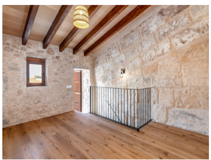
Natural stone walls