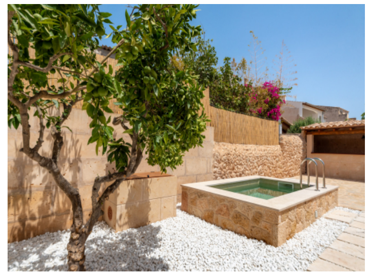
Patio with pool