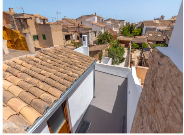
View from the topfloor ovver the neighborhood