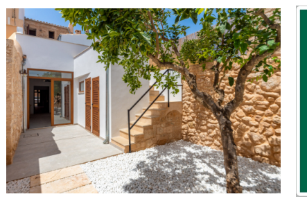
Llucmajor search for property MAL-121714