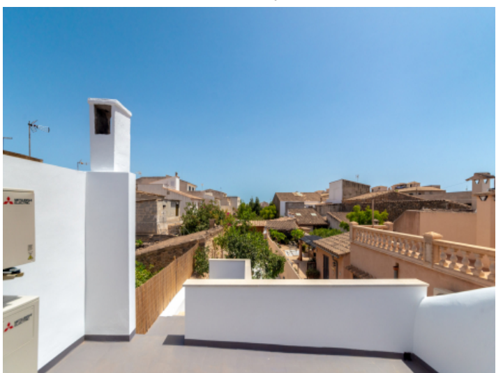
Rooftop terrace with views