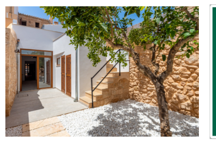
Llucmajor search for property MAL-121714