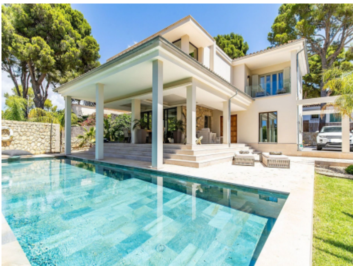
Villa in top location