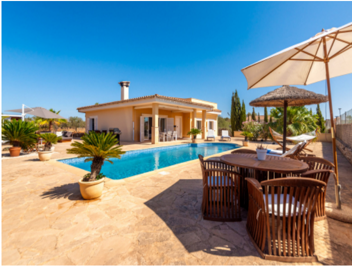
house, Sa Rapita