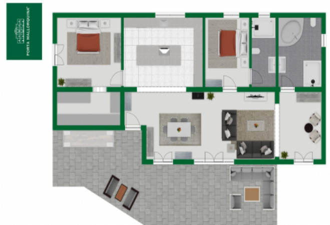
Floor plan groundfloor