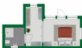
Floor plan groundfloor