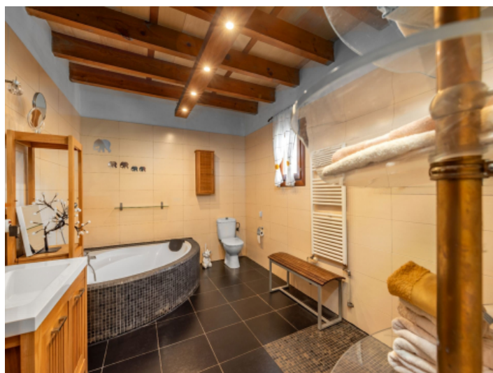
Finca with 4 bathrooms