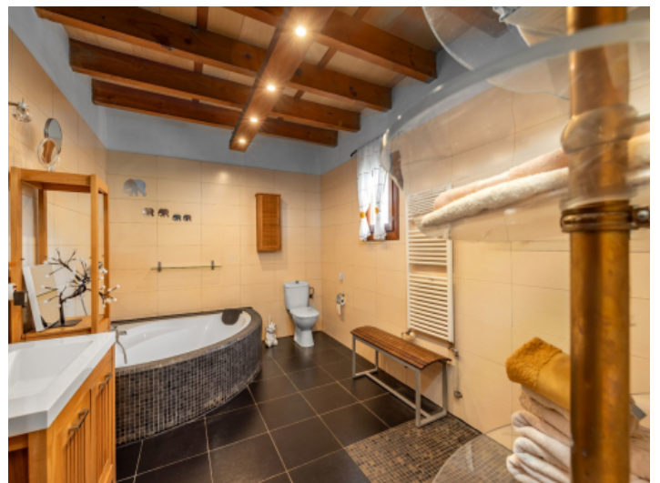
Finca with 4 bathrooms