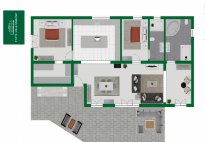
Floor plan groundfloor