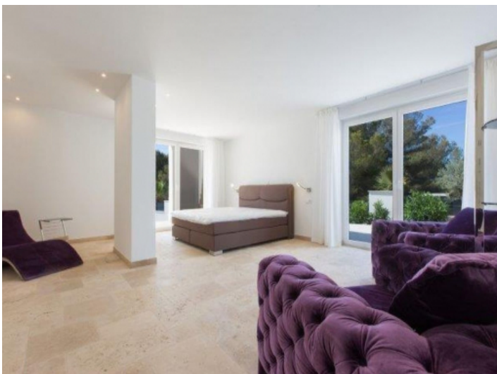
Master suite with double bed