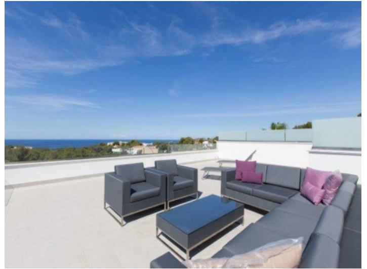
Spacious terrace with sitting area