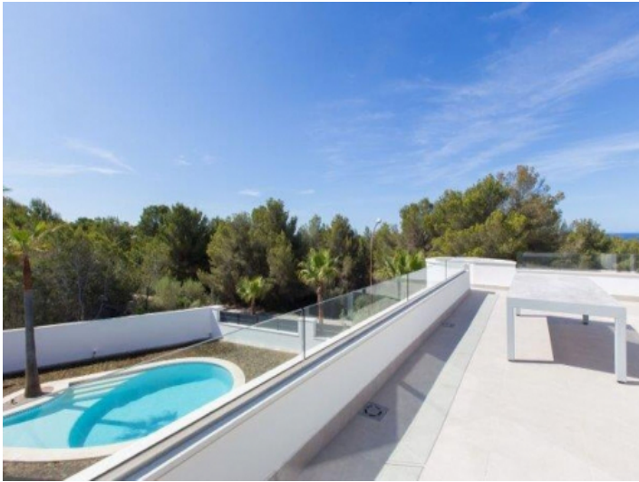
Pool view from the upper terrace