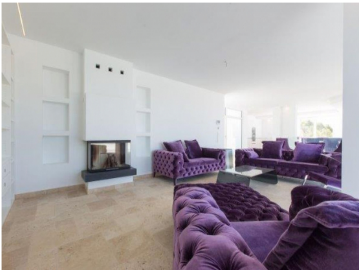
Living area with fire place