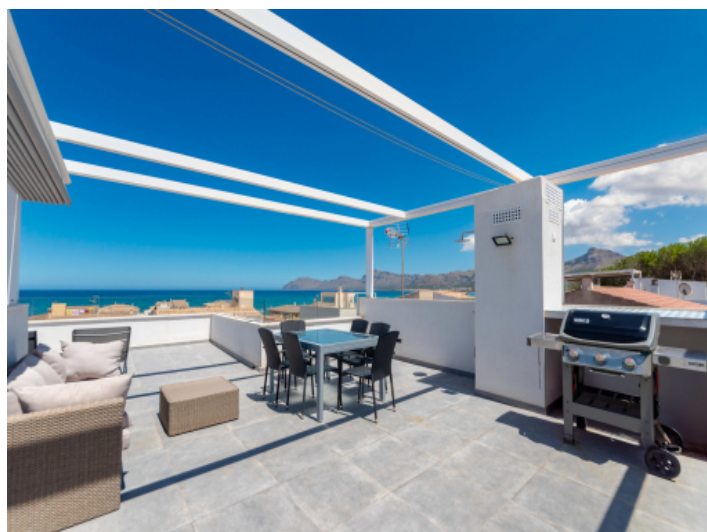
Rooftop with BBQ and sea views