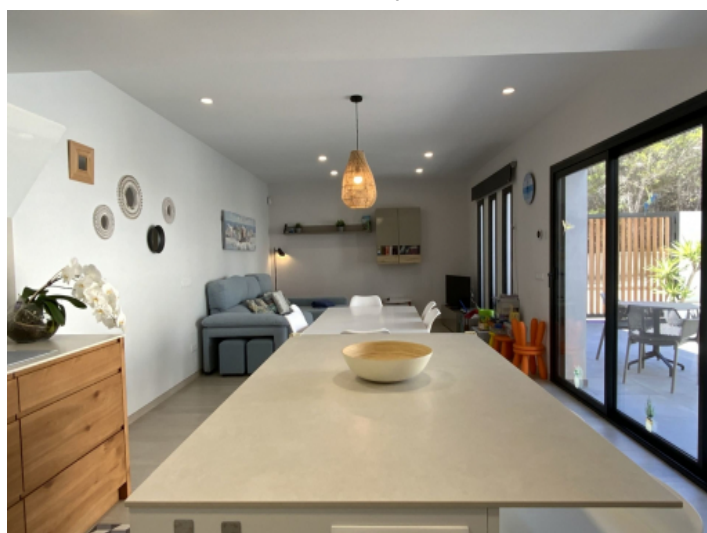
Living and dining area groundfloor