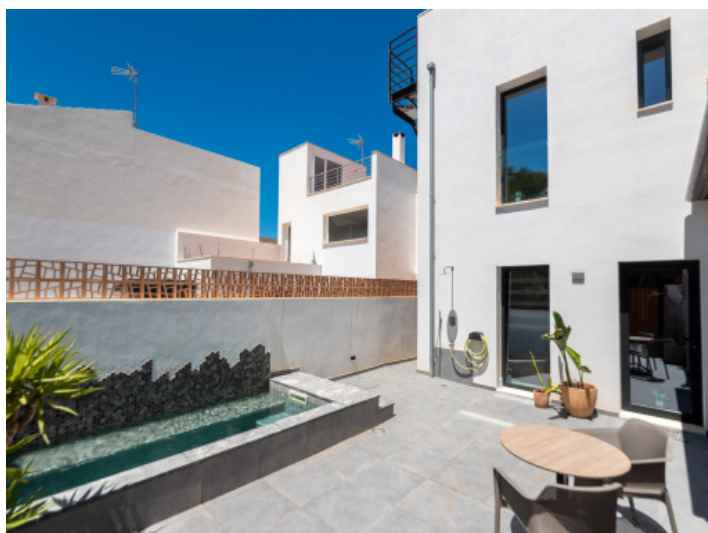
Patio and pool