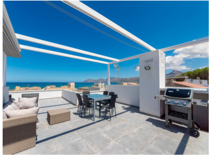
Rooftop with BBQ and sea views