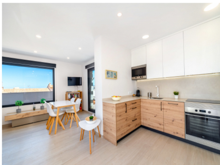
Kitchen upper floor