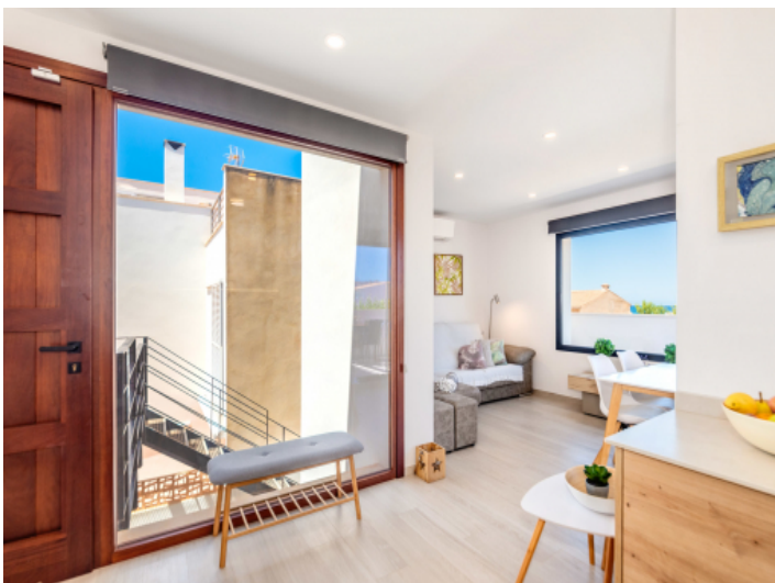
Entrance area upper floor