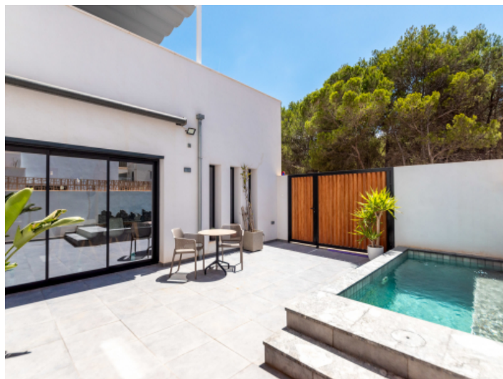
Patio with pool