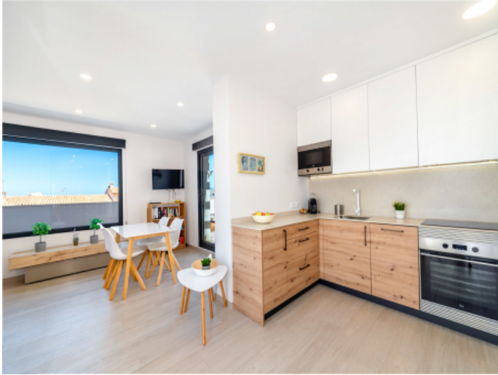
Kitchen upper floor