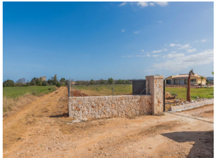
Entrance way to the finca