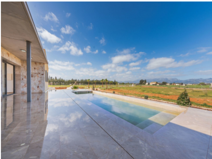
Terrace and pool