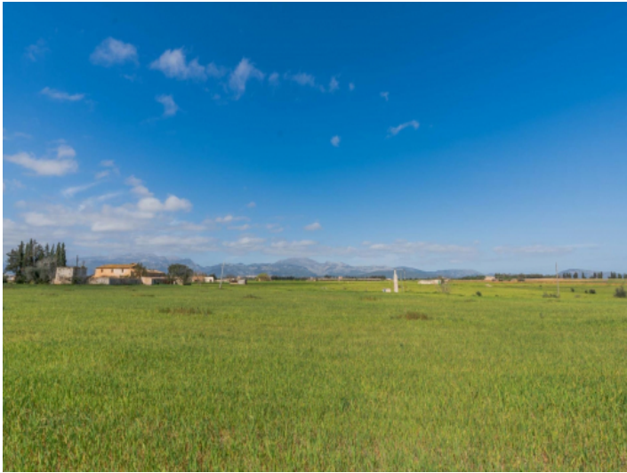
Views to The Tramuntana Mountains