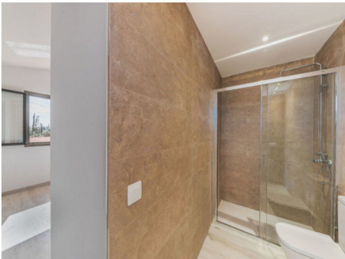
Bathroom en suite