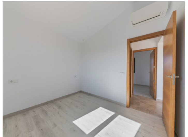
On the first floor a 2 bedrooms