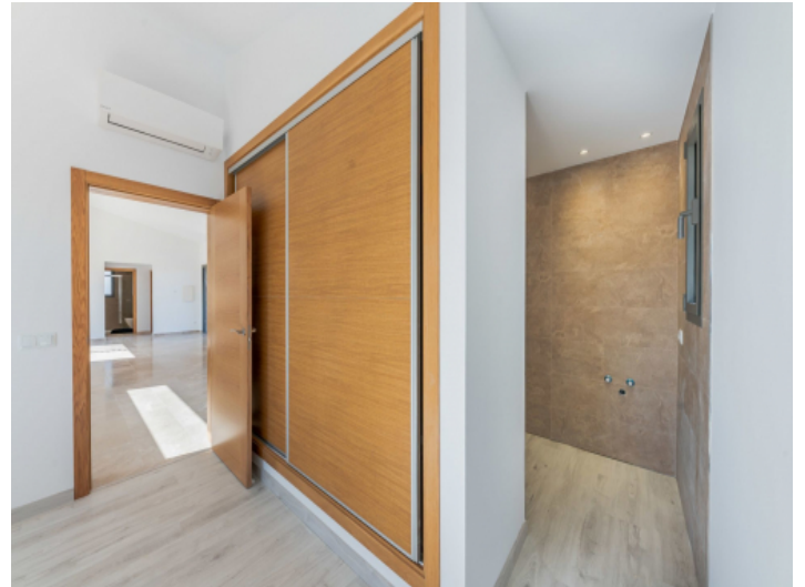
Groundfloor bedroom with bathroom en suite