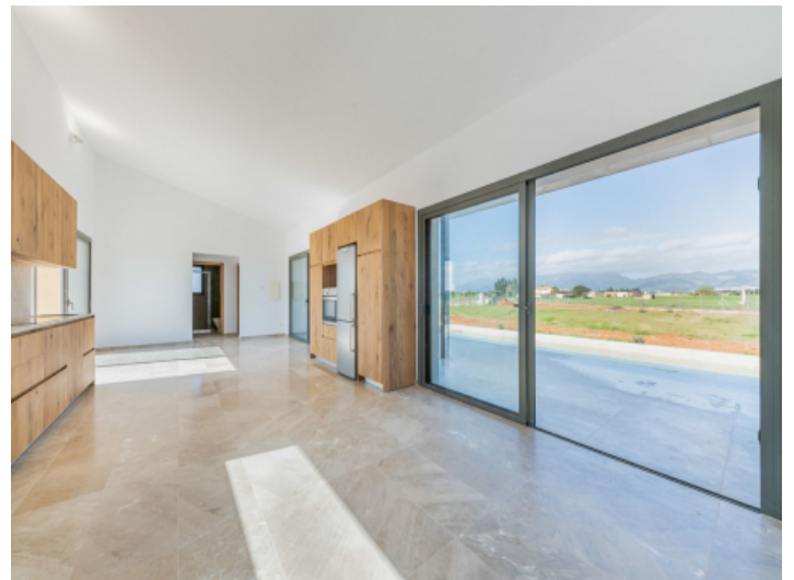
Kitchen and living area