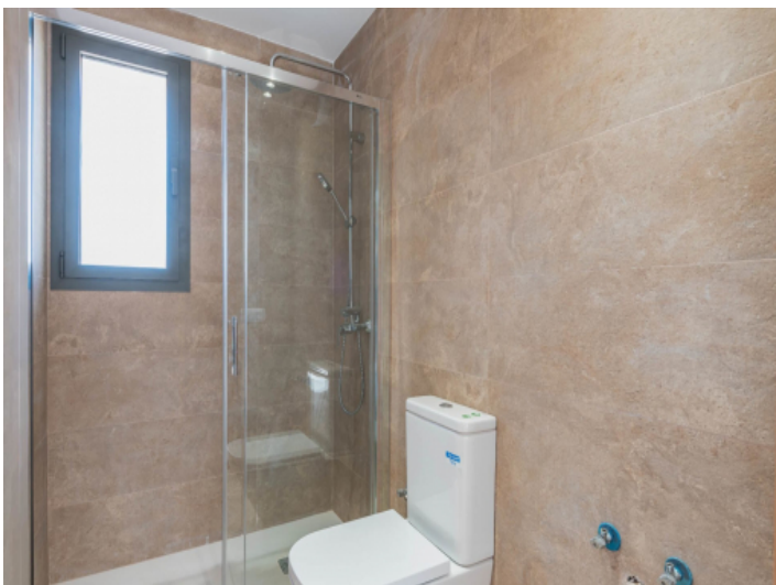
One of 3 bathrooms