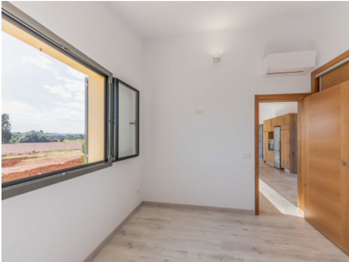
Bedroom on the groundfloor