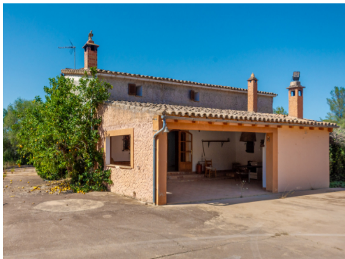
Rustic finca with views and lots of potential near Sant Joan