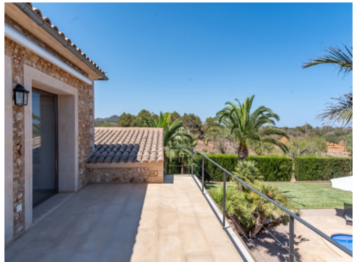
Terrace of the living area