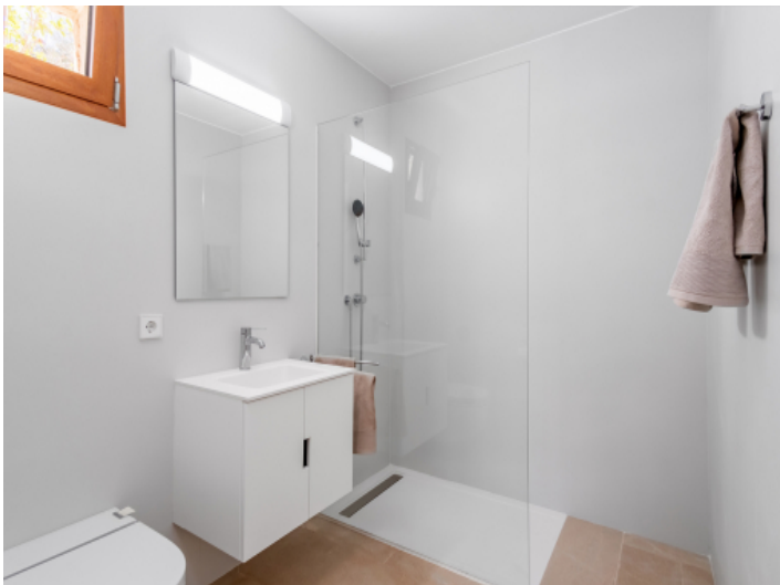
Bathroom en suite