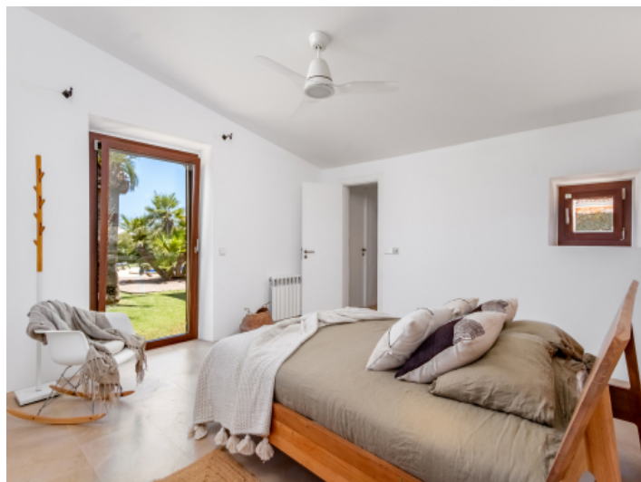
Bedroom with direct access to the garden