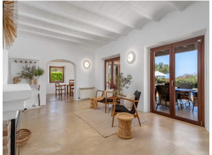
Bright entrance area