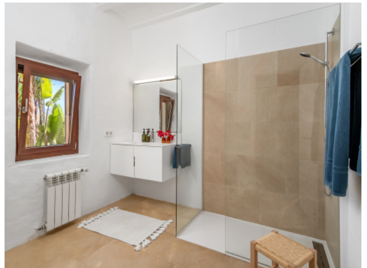
Bathroom en suite