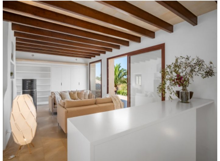
Elegant living area