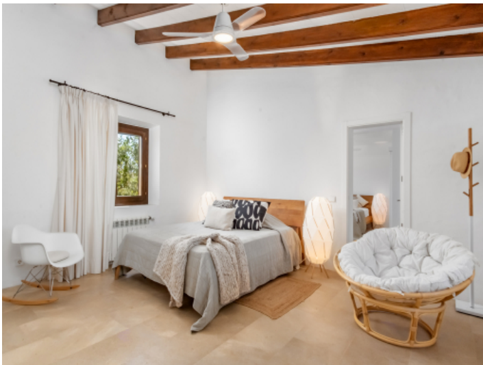
All bedrooms with bathroom en suite