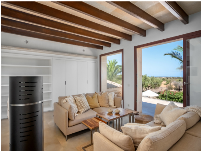
Living area with sea views