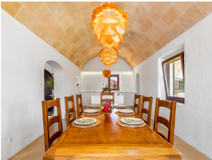
Dining area and sandstone vault