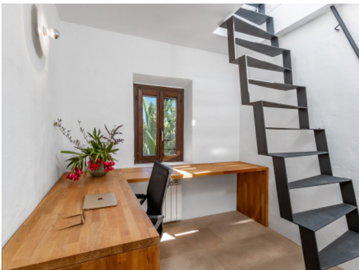
Study room and staircase to the rooftop