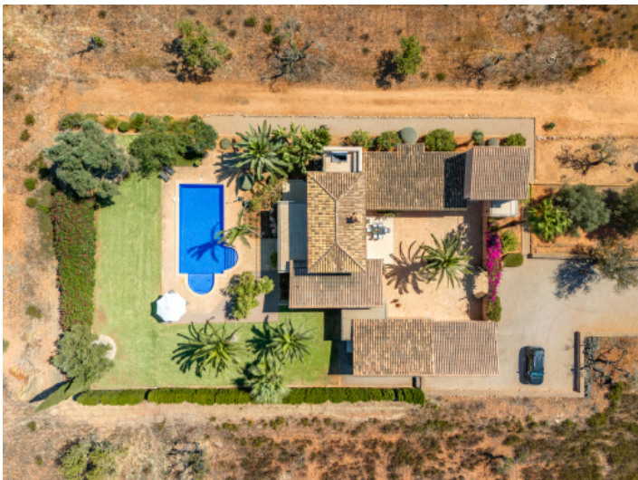
View to the property