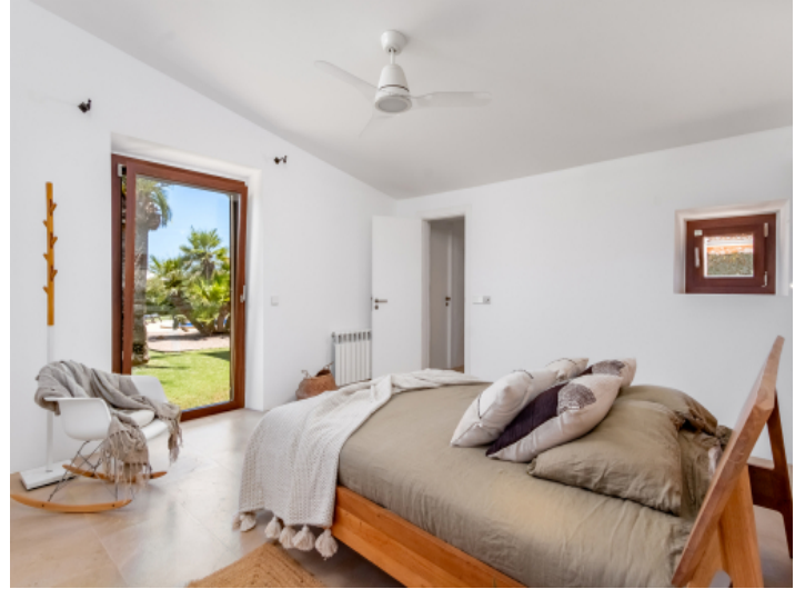
Bedroom with direct access to the garden