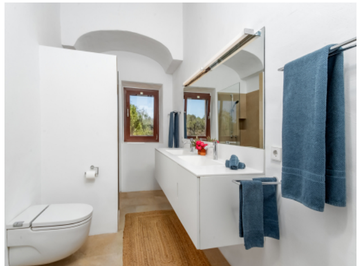
Bathroom en suite