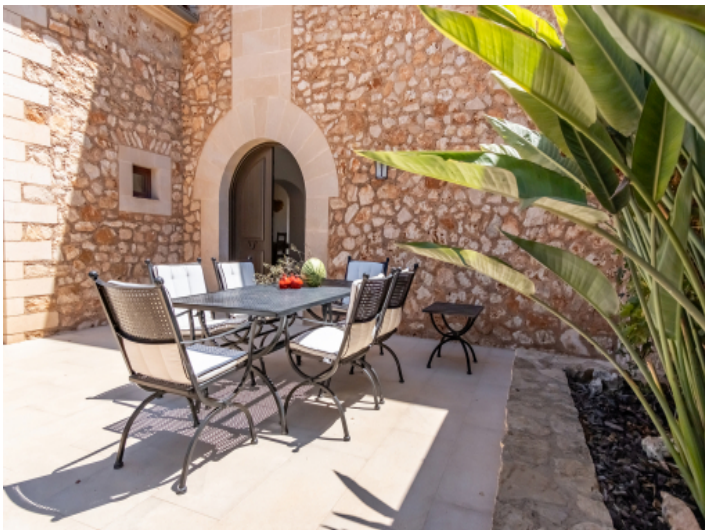
Dining area in the patio