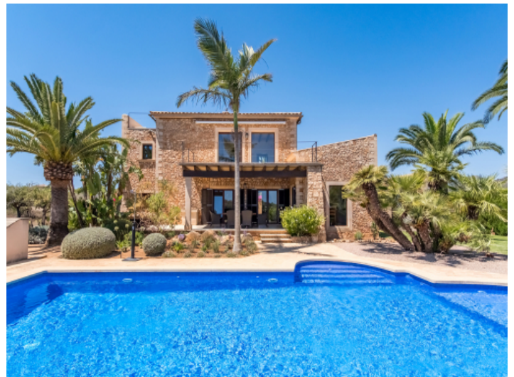
Stylish oasis of peace