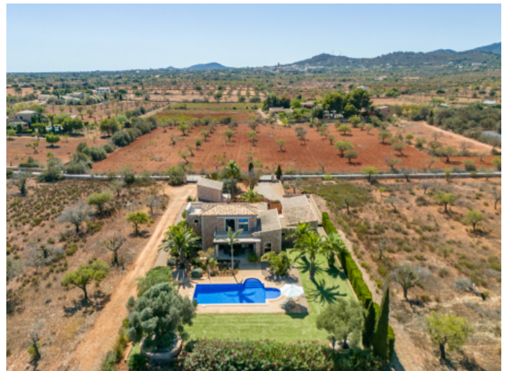
Lots of privacy