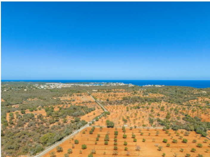
Close to Portocolom