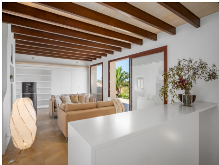
Elegant living area