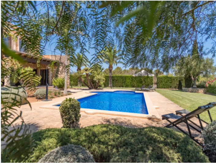
Beautiful pool area