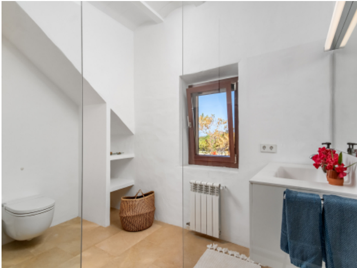
Bathroom en suite