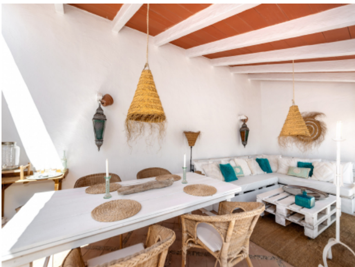
Terrace and lounge area