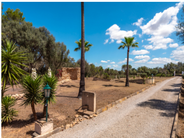
Access to the finca