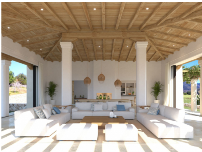
Prestigious new-build project in the middle of Mallorca's unique nature, Manacor, Sant Lorenzo