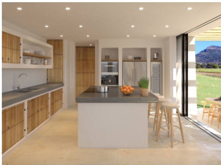
Kitchen with large kitchen island