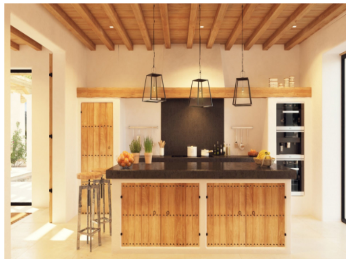
Country style kitchen