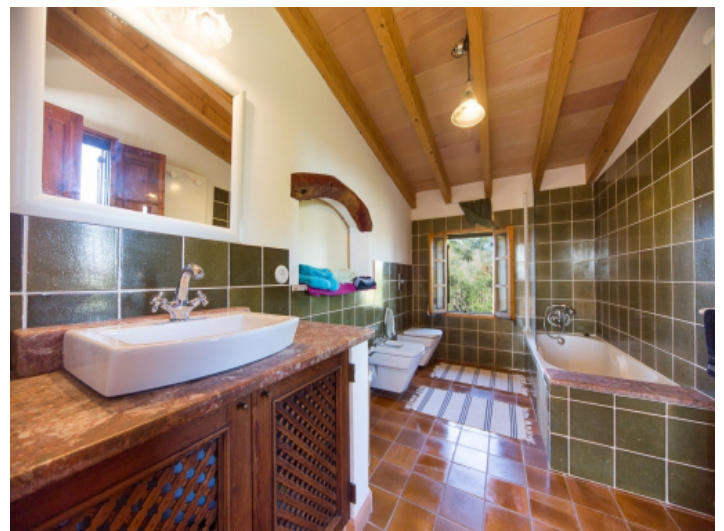
Large master bathroom with bath tub