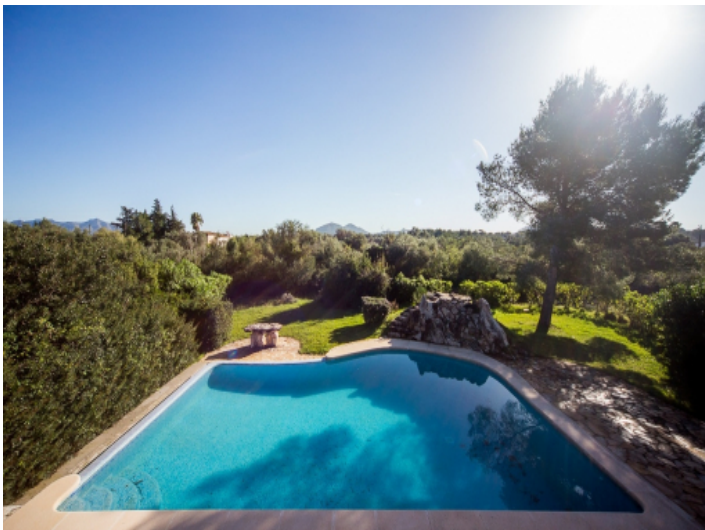
Lovely views of the pool and the surrounding