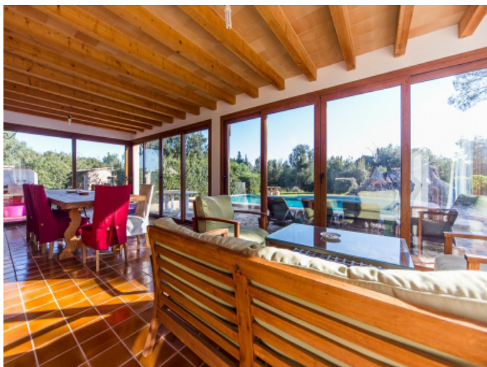
Bright entertainment area on the ground floor