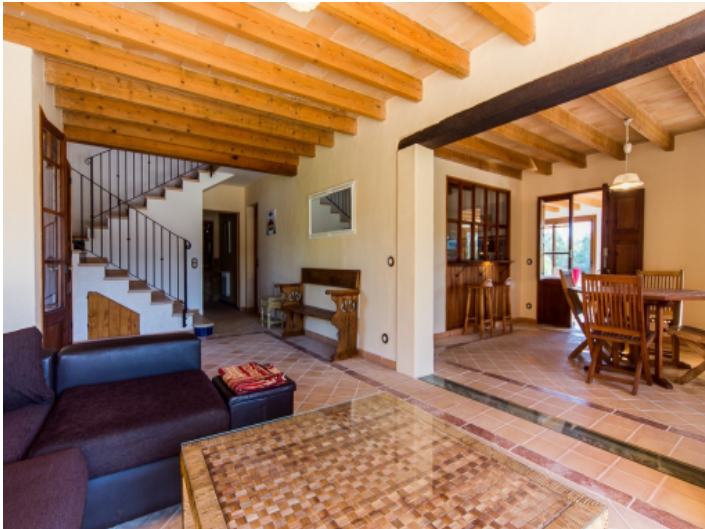
Entrance area, living and dining room