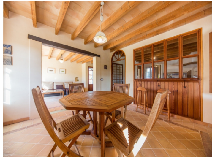
Dining area beside the living room