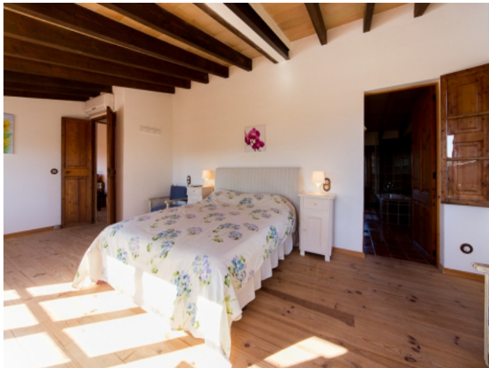
Master bedroom on the upper floor with bathroom en suite