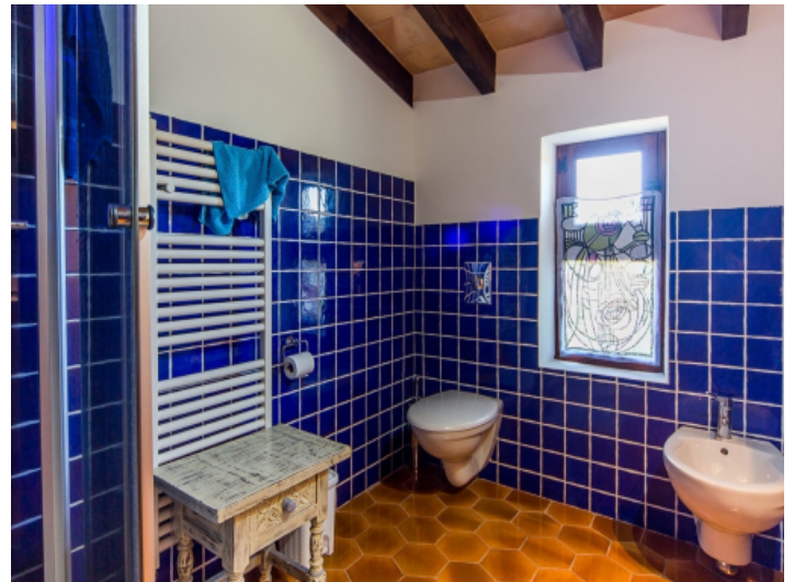
Second bathroom with shower