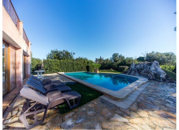
Lounge area beside the pool