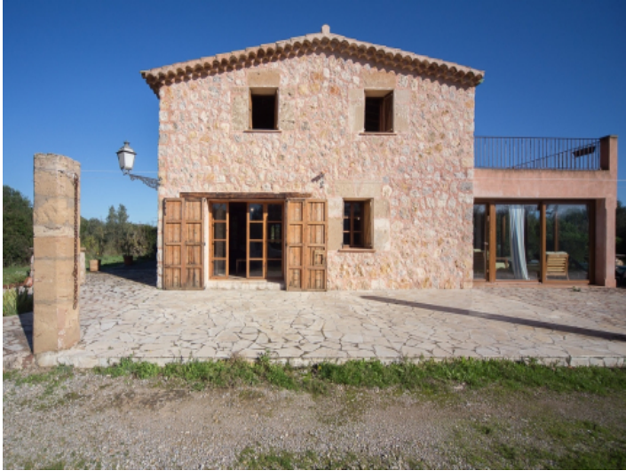
Traditional stone-clad façade