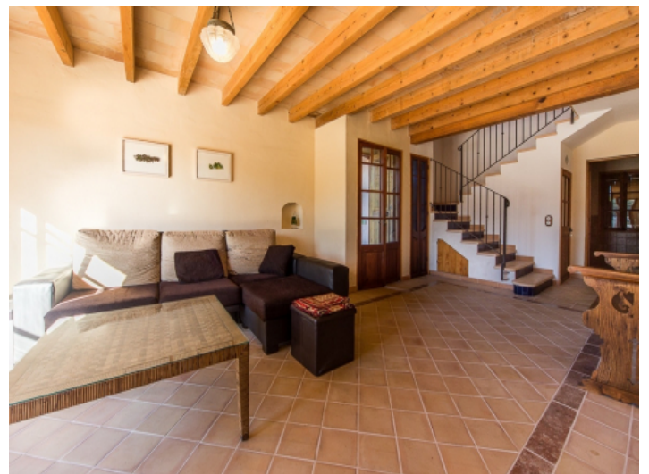
Friendly living area

PORTA MALLORQUINA • C./ COLOM 20 2º, 07001 PALMA, SPAIN