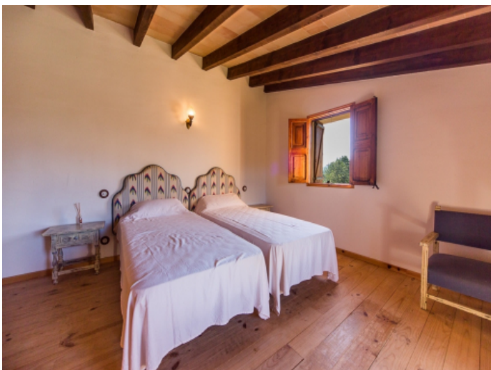
Beautiful double bedroom