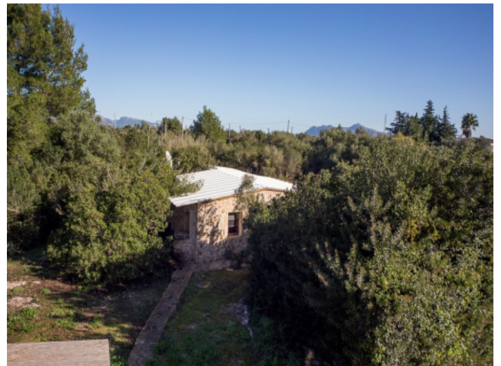
Garden with its own casita