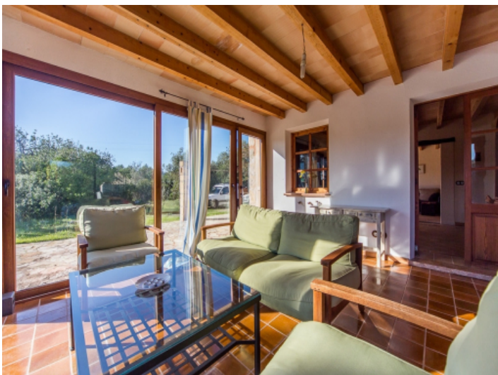
Sunny lounge area in the entertainment area