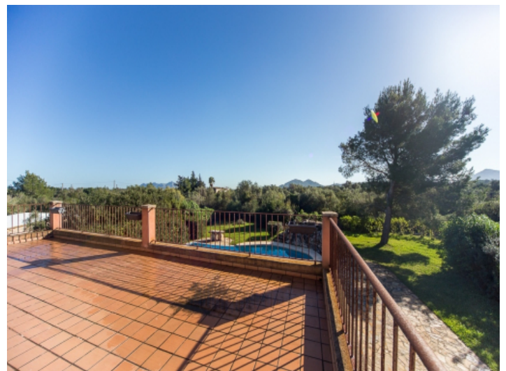
Spacious terrace with impressive views of the landscape