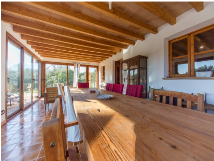
Large dining table and panoramic windows