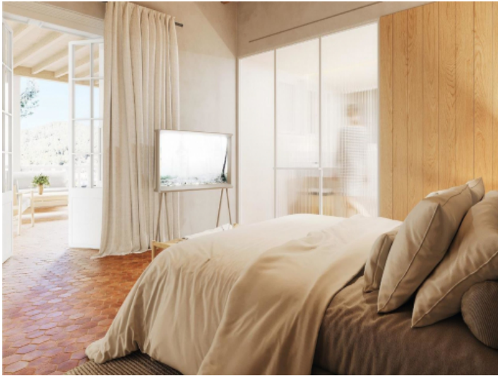
All bedrooms with bathroom en suite