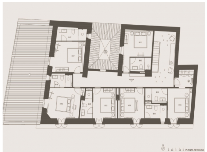
Floorplan 2nd floor