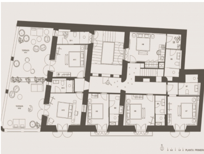
Floorplan 1st floor