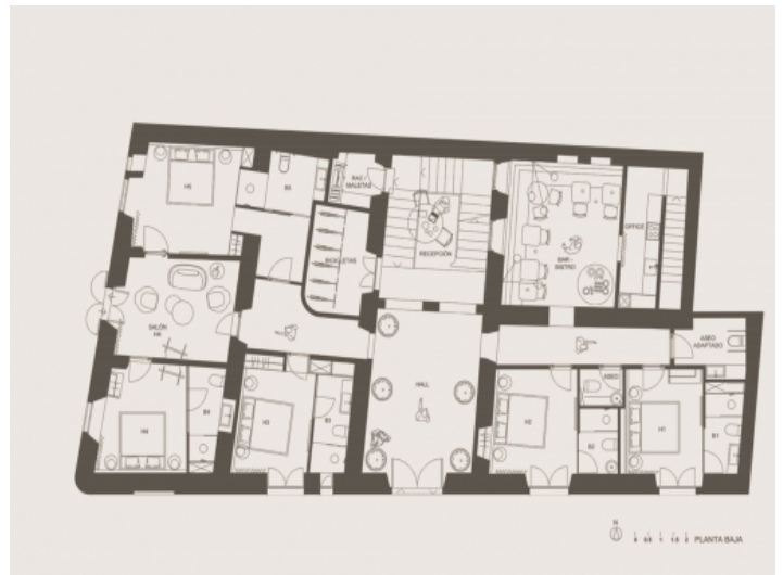
Floorplan ground floor