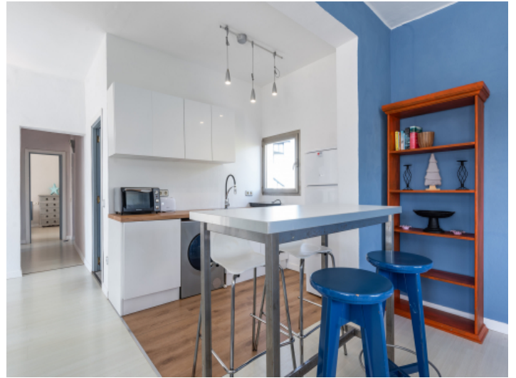
Kitchen with bar