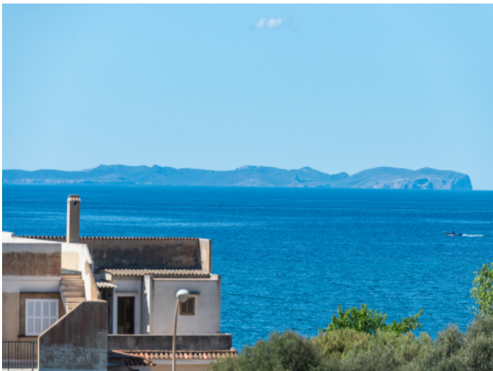
Mediterran sea views