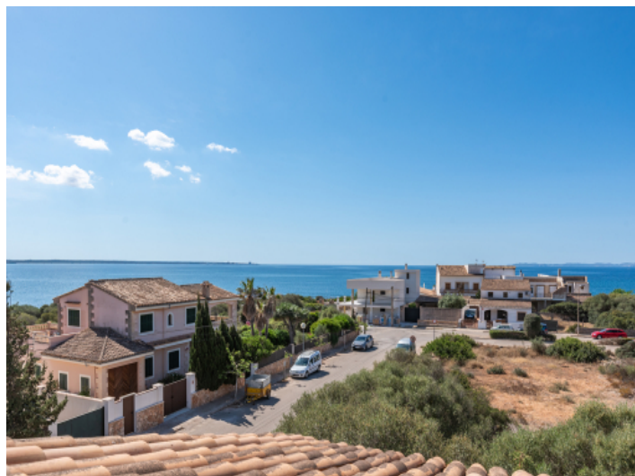
Mediterran des views