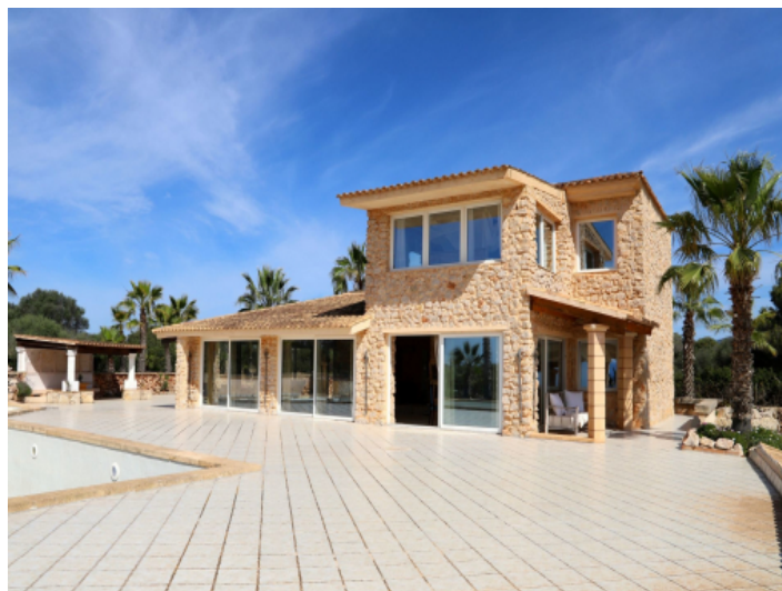
View to the house