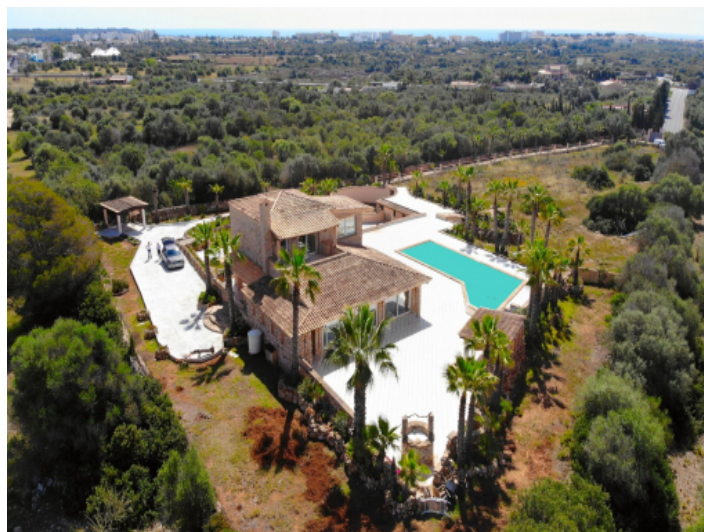
Holiday rental licence