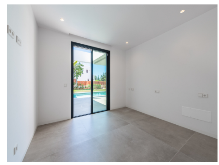
Bedroom on the groundfloor