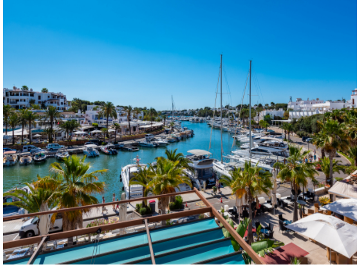
Yachtharbour Cala D'Or