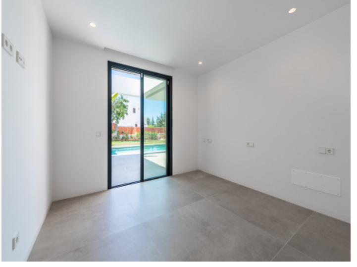
Bedroom on the groundfloor