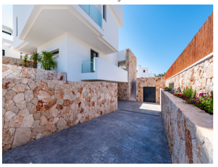
Access to the underground parking