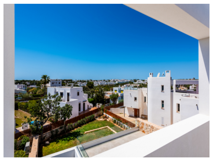
Views from the rooftop