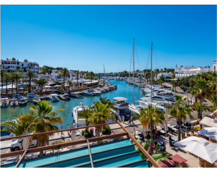
Yachtharbour Cala D'Or