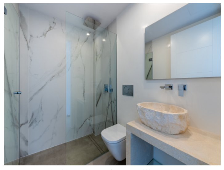
Bathroom on the groundfloor