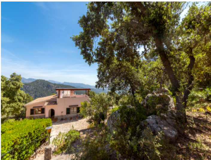
Surrounded by nature