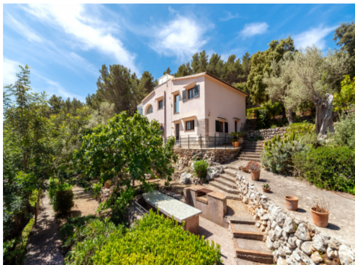
Garden and facade