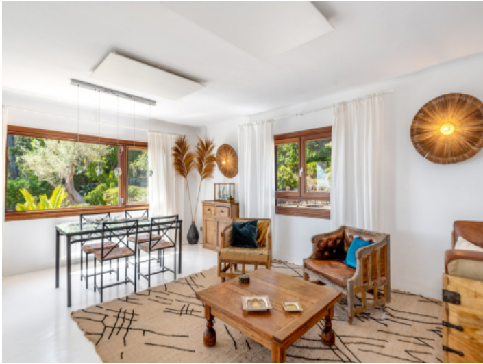
Bright living area