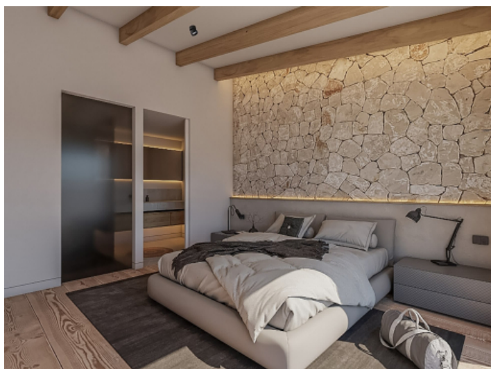
Elegantly renovated village house with pool and garden in