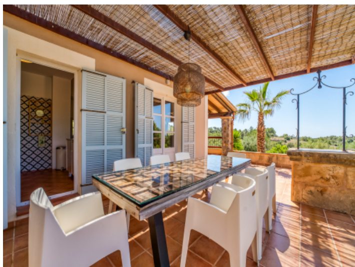
Outside dining area