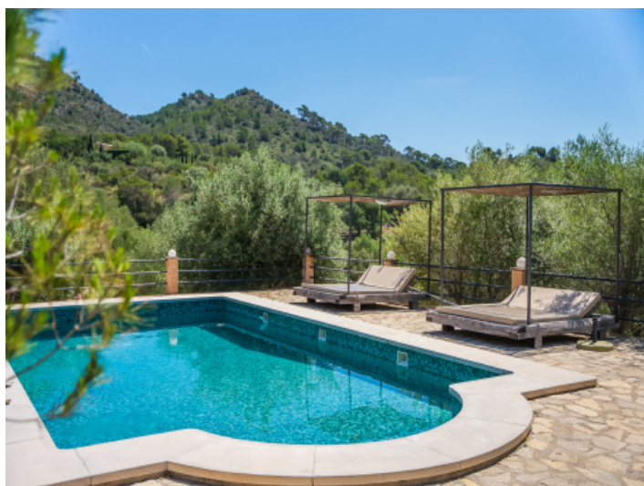
Pool embedded in nature