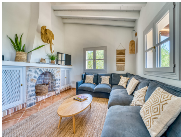
Living area with fireplace