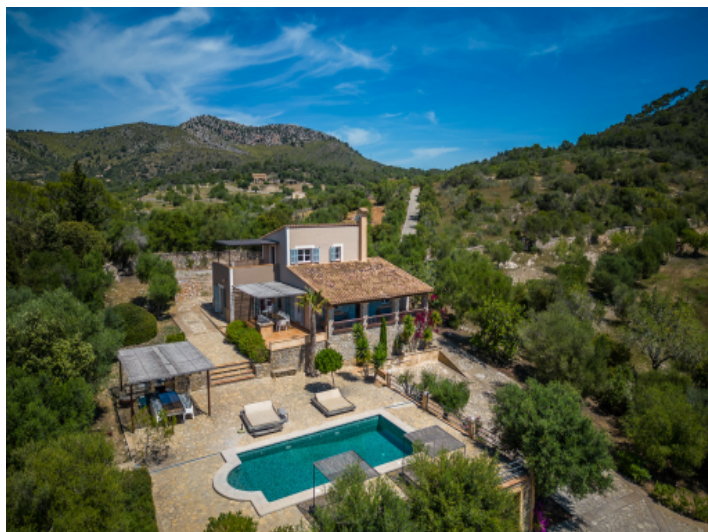
Modern finca on a hill in a nature reserve with vacation rental