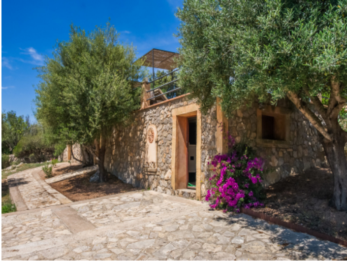
Engine room under the pool