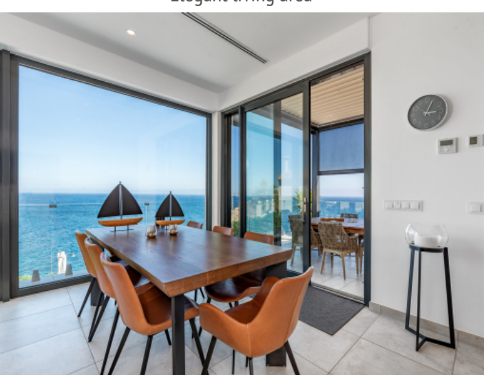
Bright dining area with sea views