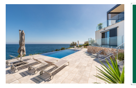
Cala Murada search for property MAL-121528