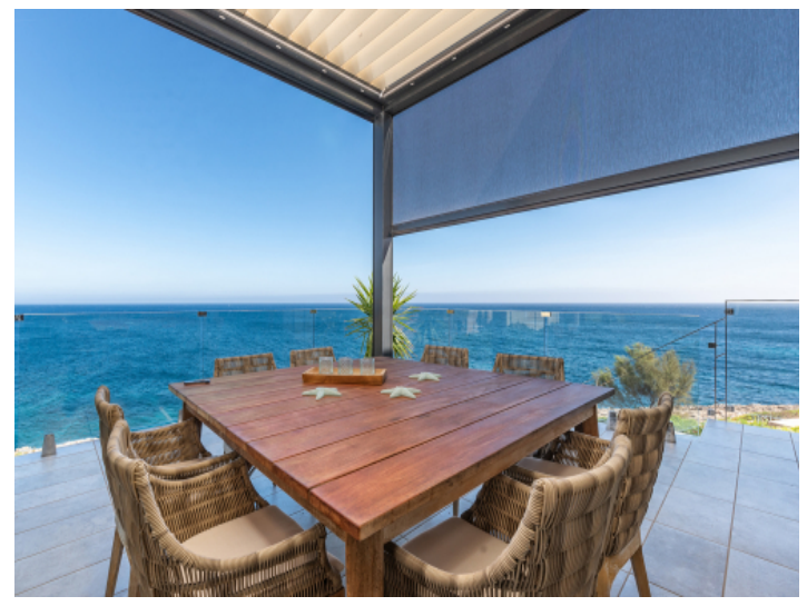
Covered terrace with breath-taking views