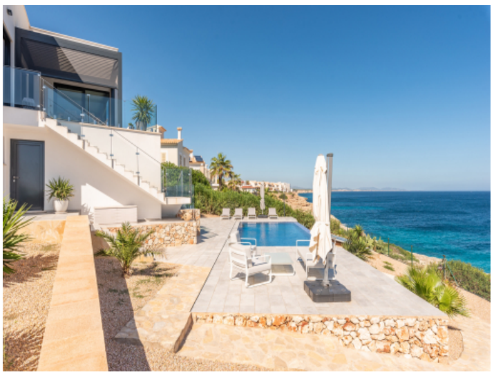
Superb outdoor area