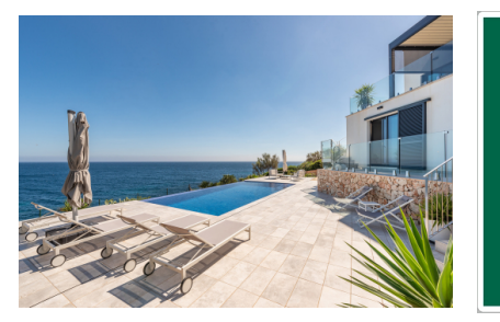
Cala Murada search for property MAL-121528