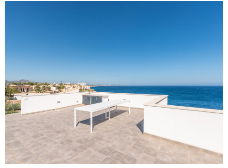
Large roof terrace