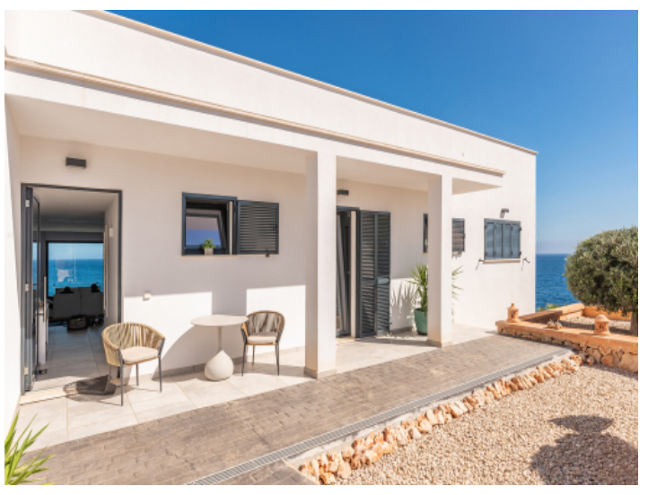
Modern entrance area