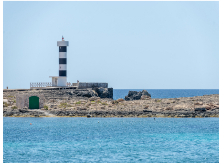
Lighthouse of Cala Gaviota