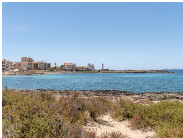
Colonia St. Jordi