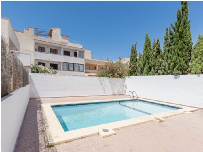
Patio con pool