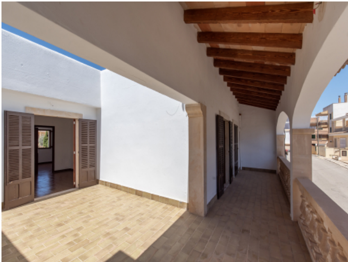
Large terrace on the first floor