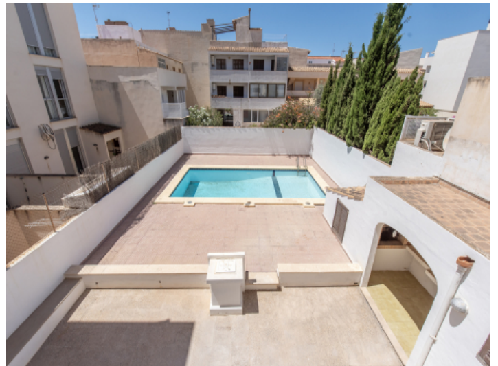
Views to the patio and pool