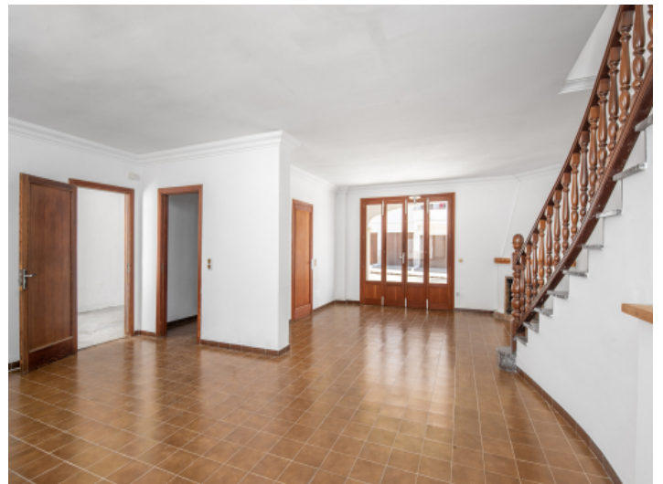
Entrance hall and living area