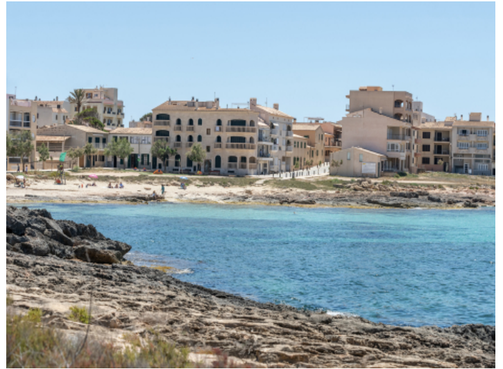
Close to Cala Gaviota beach