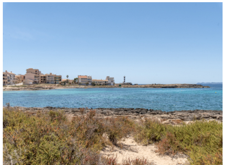
Colonia St. Jordi