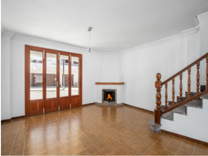
Entrance area with fireplace