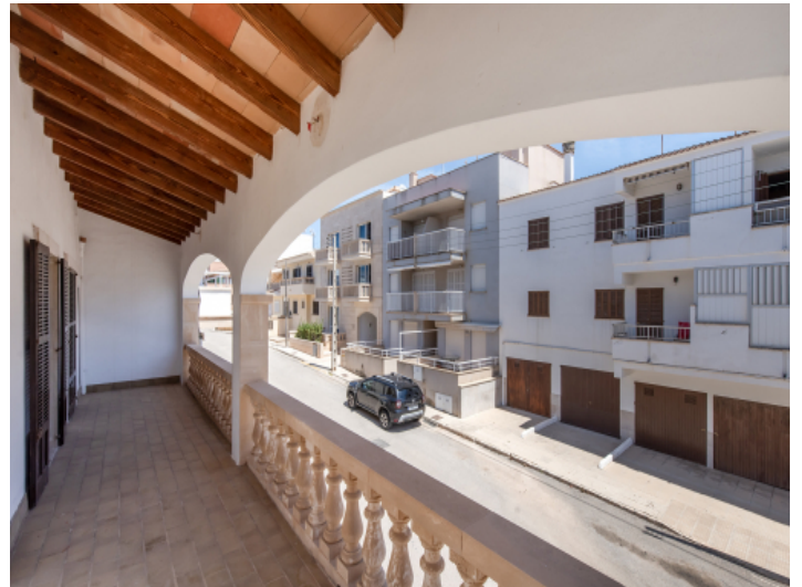
Views over the neighborhood