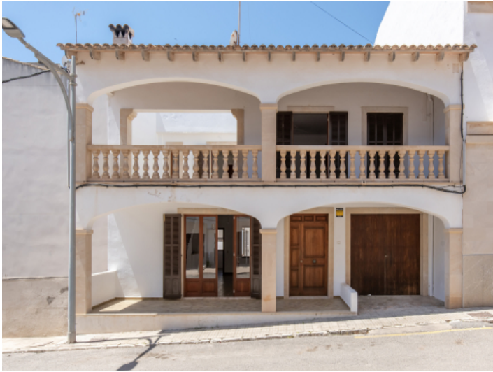
Typical mallorcan southern coastal facade