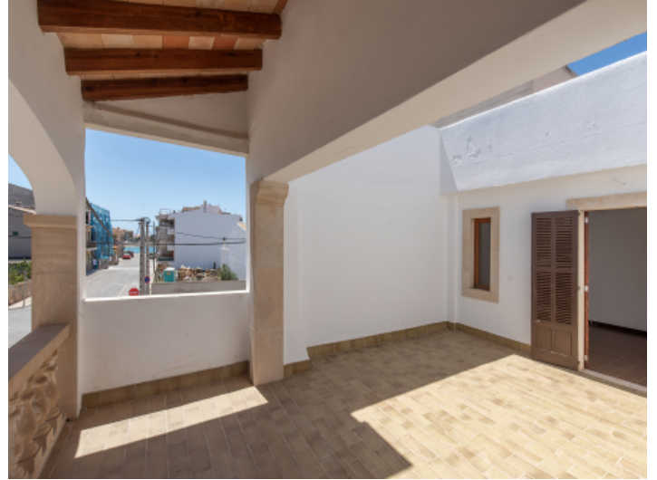
Lateral sea view