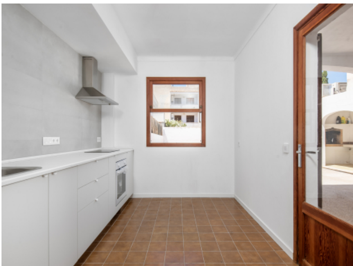
Kitchen with direct access to patio