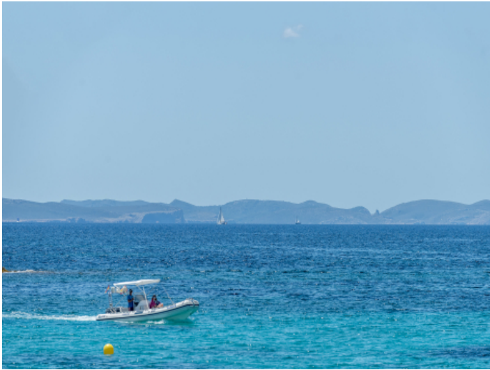
Views to Cabrera from the beach