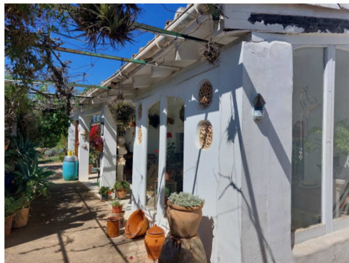
Part of the facade