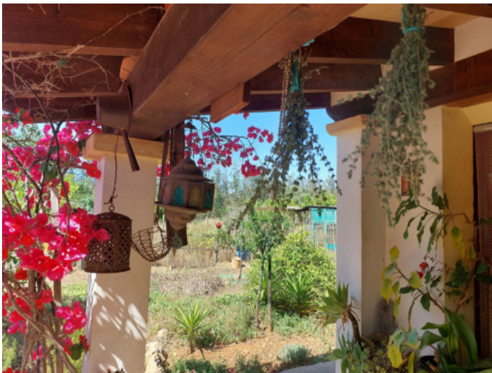
A property with lots of possibilities