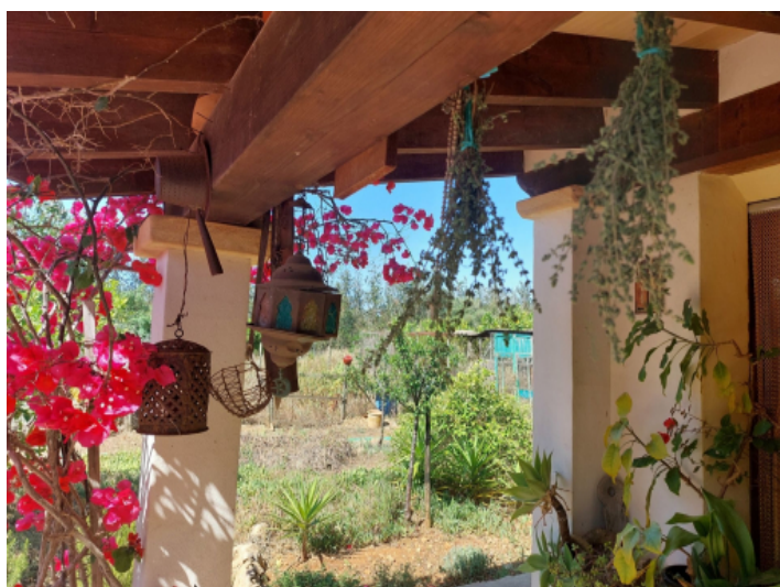
A property with lots of possibilities