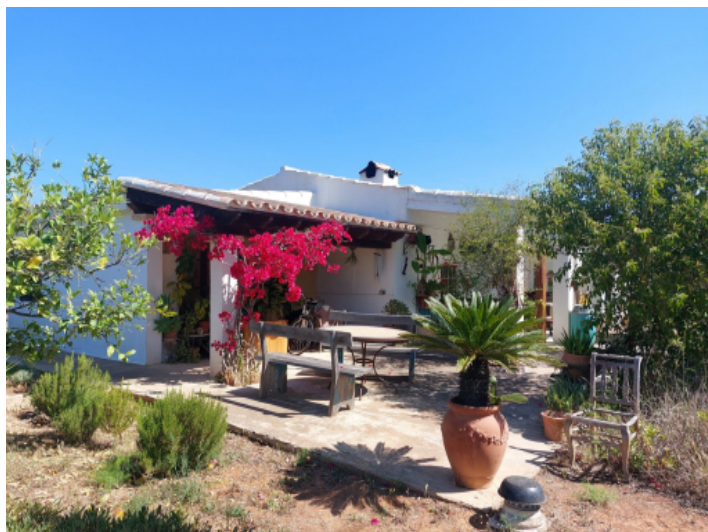
Charming finca in top location near Binissalem