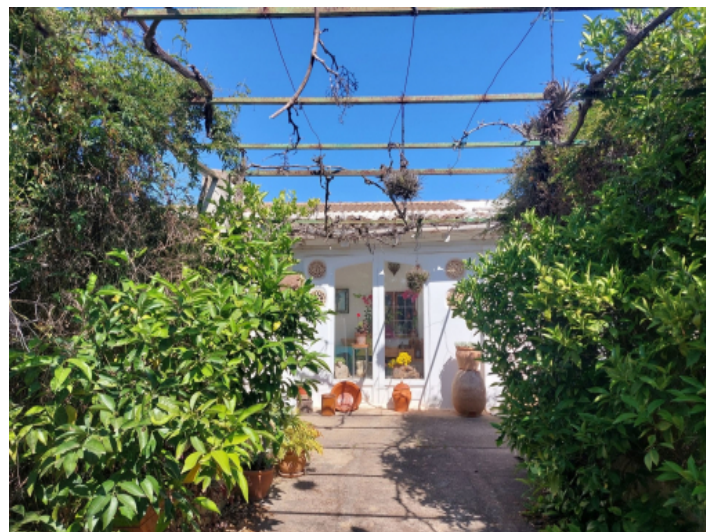
View to this little gem