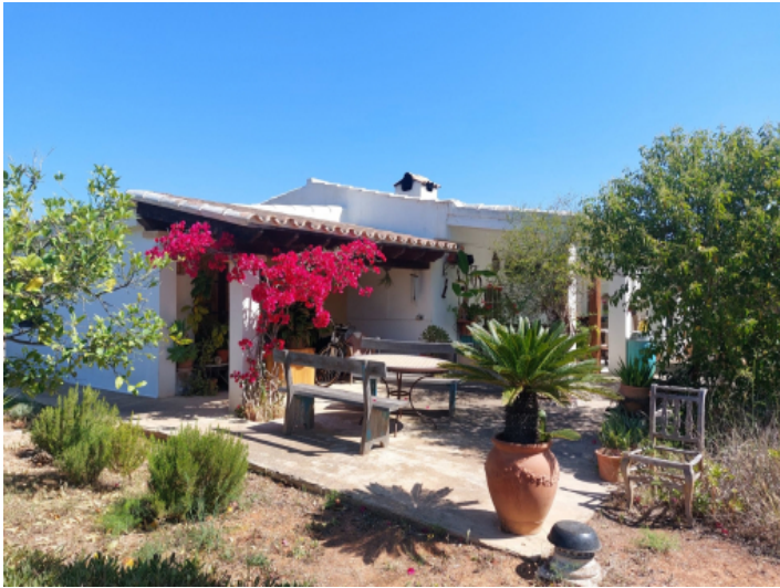
Charming finca in top location near Binissalem