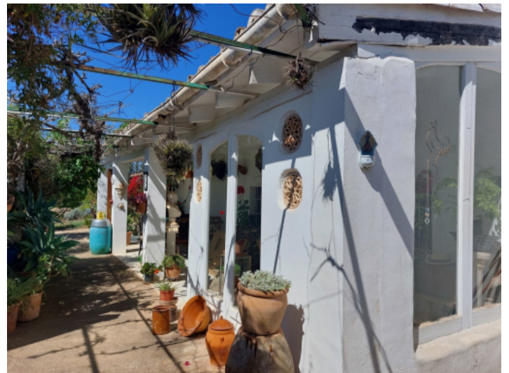
Part of the facade