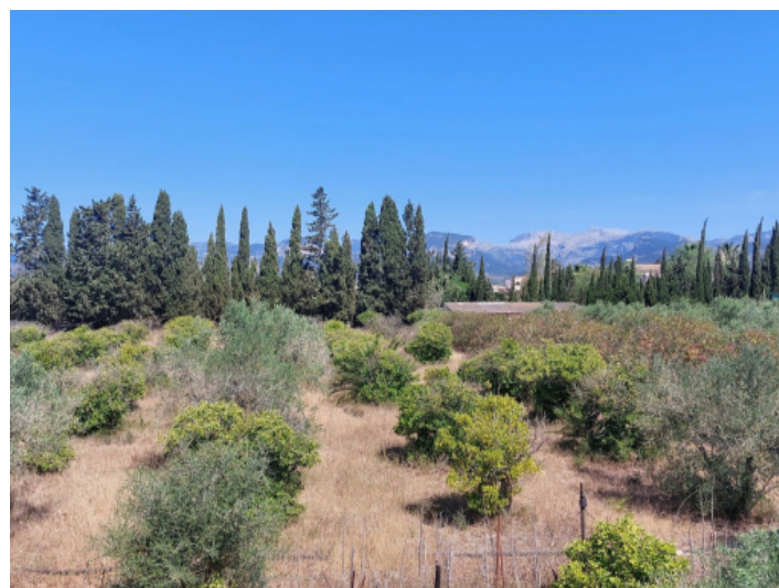
Plot and views