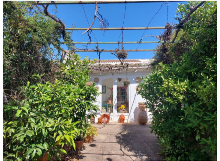
View to this little gem