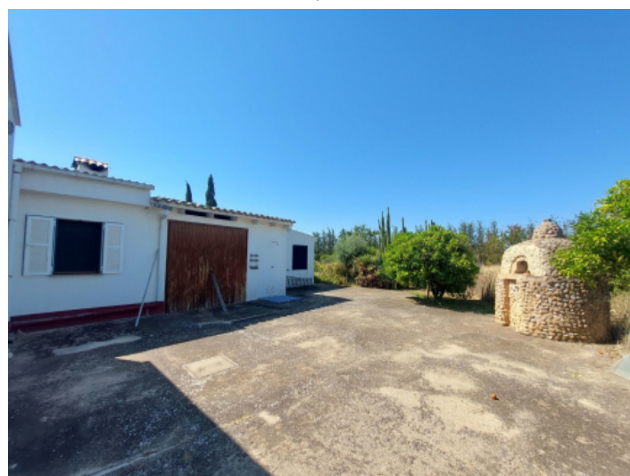
Front facade and pizza oven oven