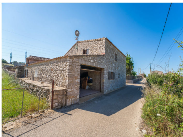
Garage and facade